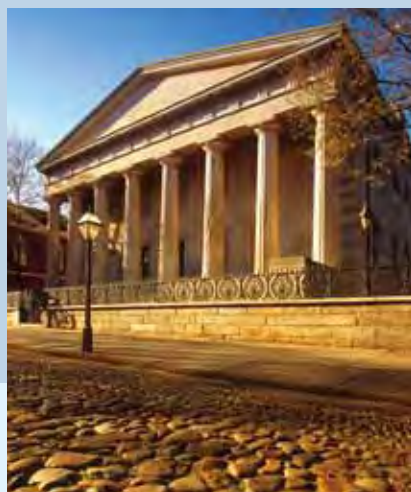
Second Bank of the U.S.