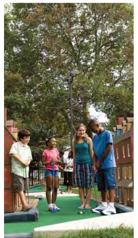
Philly Mini Golf (J. Holder)

Philly Mini Golf , Center City's only miniature golf course! The course allows you to putt through famous Philadelphia attractions such as the Liberty Bell and the Art Museum . Additionally, there are two extraordinary playgrounds for kids of all ages, as well as seated and shaded areas for parents to relax and enjoy watching their children run and play. Whether you just want to lounge outside or you're ready for a day full of activities Franklin Square is the place for you!