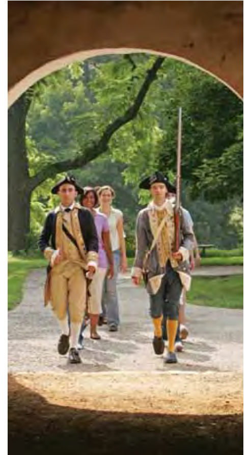
Valley Forge After Hours

For tickets, call (215) 629-4026 or go to www.historicphiladelphia.org