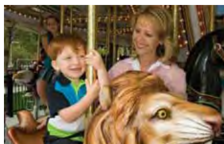
Franklin Square Carousel

H istoric Philadelphia offers more than cultural experiences and education. It's fun for people of all ages! Franklin Square , voted as 2007's Best Play Space for Kids , is a place where everyone can go to have fun in the sun! Enjoy the beautiful May weather while enjoying ice cream, hamburgers, hot dogs, soft pretzels, and other refreshments. Sit and enjoy a picnic by the beautiful fountain, or take a ride on the Philadelphia Park Liberty