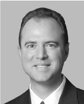
Adam B. Schiff of Burbank (29th District) Democrat—2d term