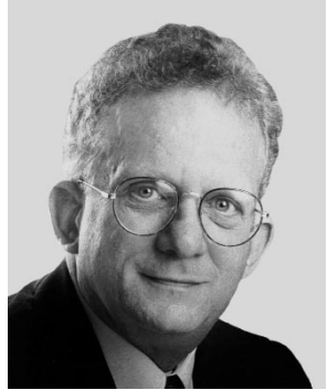
Howard L. Berman of North Hollywood (28th District) Democrat—11th term