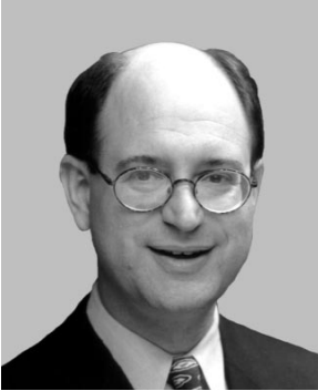
Brad Sherman of Sherman Oaks (27th District) Democrat—4th term