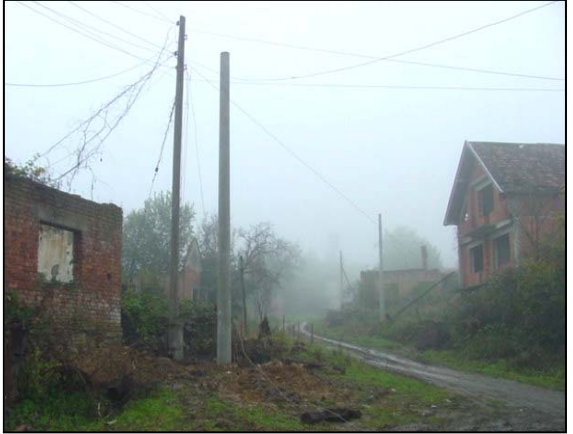
Power lines down in Branesci.

The life for people in the village of Branesci in Croatia is returning to normal as electricity is finally restored with the help of USAID's Community Infrastructure Rehabilitation Program. For approximately ten years, the village had no electricity due to damage suffered from the 1990's war. Next to housing reconstruction, electricity is the most important precondition for people to return to their pre-war homes.