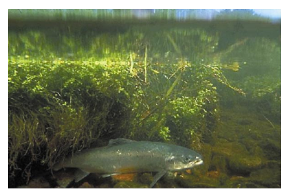
Attleboro National Fish Hatchery, Atlantic Salmon

Lake Superior Lakewide Management Plan 2000