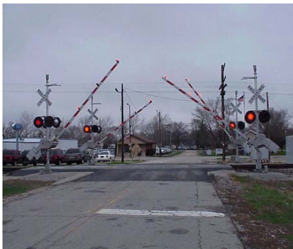
Figure 2. Four-quadrant gate grade crossing in Gardner, Illinois.

A typical four-quadrant gate crossing/vehicle detection warning system on the HSR corridor is shown in Figure 2. The core of this system is a microprocessor-based exit gate controller (EGC). The EGC works in tandem with the inductive loop detection subsystem to identify motor vehicle presence within the grade crossing and supply the appropriate input to the exit gates. During a train event at the crossing, the EGC prevents the exit gates from lowering