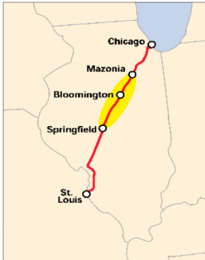
Figure 1. Chicago-St. Louis HSR route, with PTC section highlighted in yellow

The study showed that the total average delay to the five scheduled daily high-speed passenger roundtrips was an estimated 10.5 minutes, or approximately 1 minute per train. Overall, extensive analysis of the trouble ticket data showed that the four-quadrant gate and vehicle detection equipment are as reliable as the conventional crossing gate while providing additional protection.