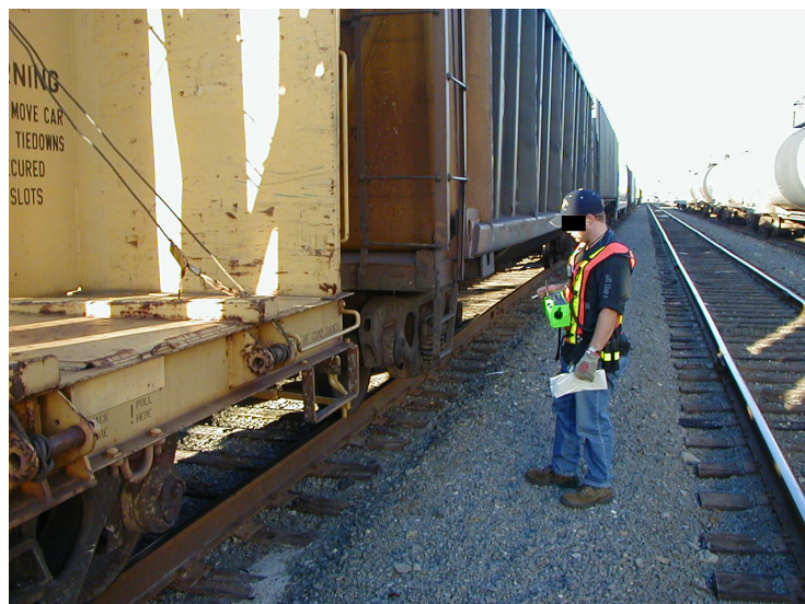
Figure 1. RCO making coupling