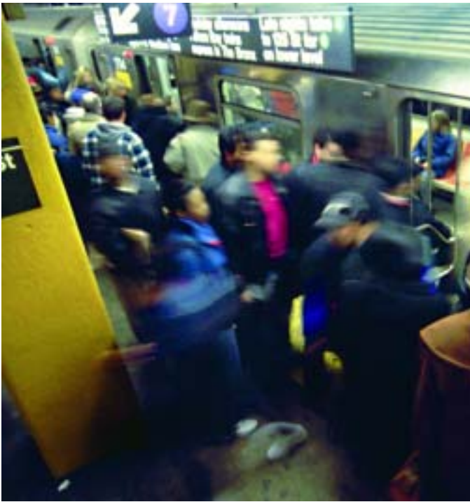
SYSTEM SAFETY IN TRANSIT: : The Volpe Center supports FTA's efforts to integrate safety and security more fully into the life cycles of transit projects, whether they are new systems or extensions to existing systems.

ment. For instance, since 1999, the number of transit agencies with proactive System Safety Program Plans has grown to 43, and data to improve practices such as accident investigations, corrective actions, and internal audits/three-year reviews have been strengthened.