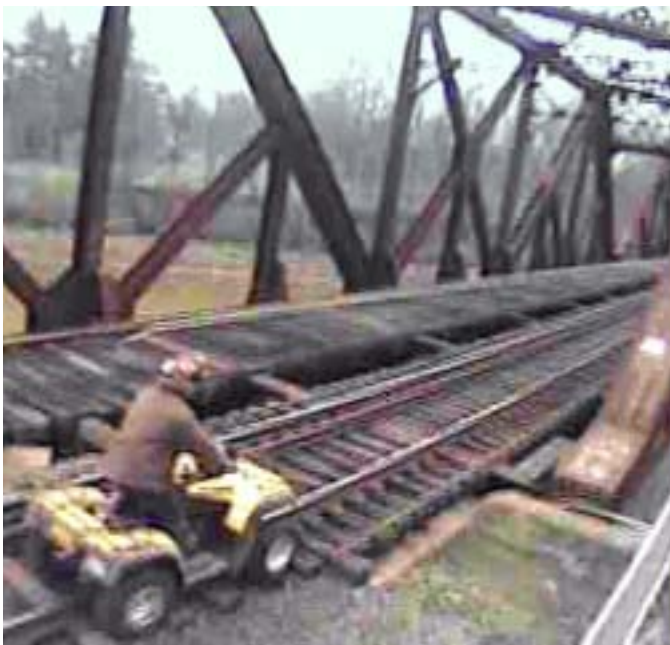
TRESPASSER ON A RAIL BRIDGE: This image was captured with a video-based trespass monitoring and detection system that Volpe is developing and testing. The system can also detect trespassers under nighttime conditions.

Visual methods for increasing train awareness need to be complemented by audible safeguards. For more than a decade, researchers at Volpe have been investigating how to improve motorist perception of train location through optimal acoustic