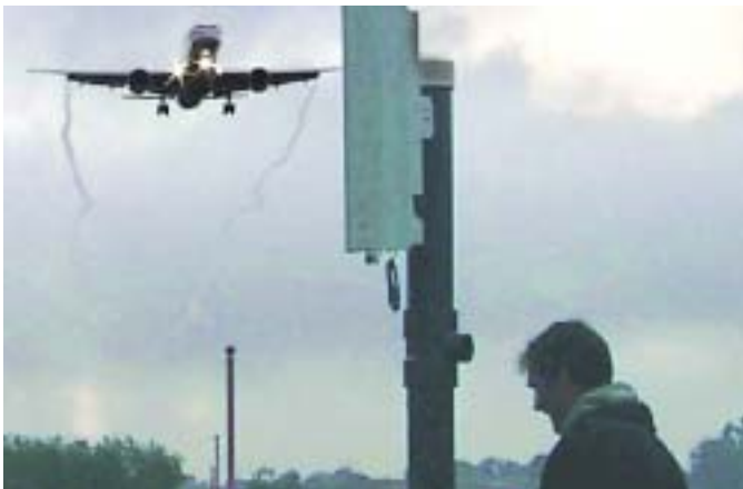
WAKE VORTEX: Landing aircraft at St. Louis International Airport and some of the Volpe instrumentation suite. Condensation in the air enables vortices from flaps to be visible.

An array of red “stop” lights at each taxiway and runway intersection provides a prompt and unambiguous indicator to pilots that a runway is not safe to enter. The fully automated lights, which are controlled by safety logic software, are integrat-