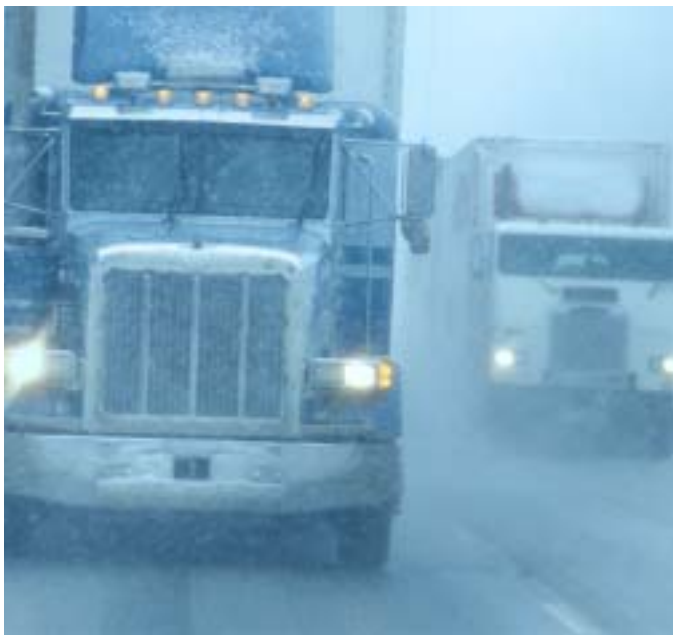
INCREASING DRIVER ALERTNESS: Driver fatigue can contribute to commercial motor vehicle crashes. The Volpe Center supports FMCSA's enforcement of the new Hours-of-Service rule, which will help ensure that commercial drivers get an appropriate amount of rest.

Volpe developed two analytic models to measure the effectiveness of three FMCSA motor carrier safety programs—