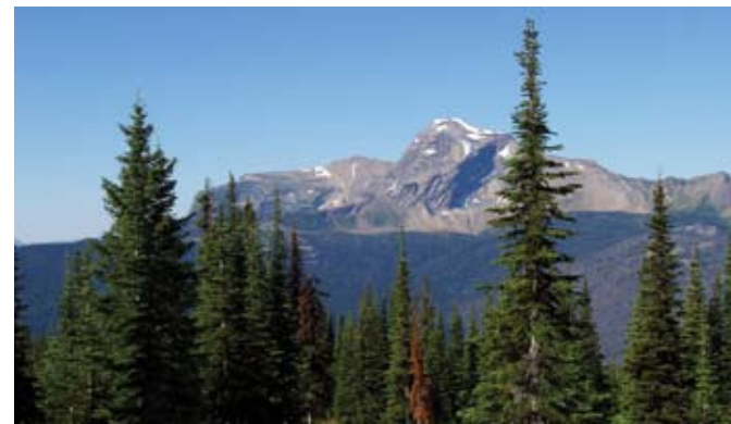
Heavens Peak from the Loop Trail