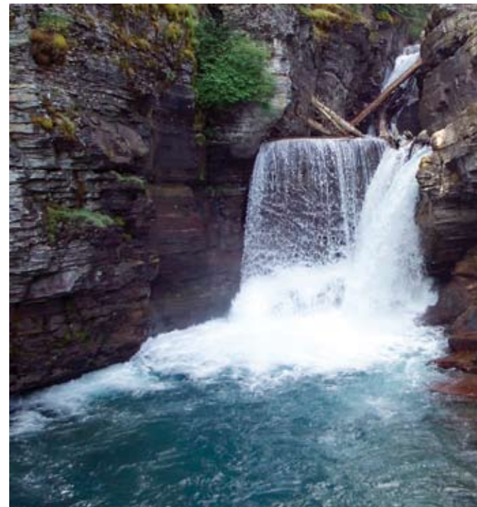
St. Mary Falls