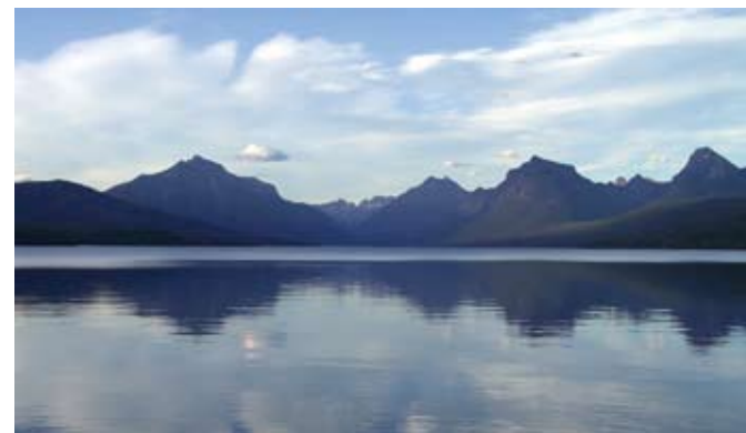
Lake McDonald from Apgar