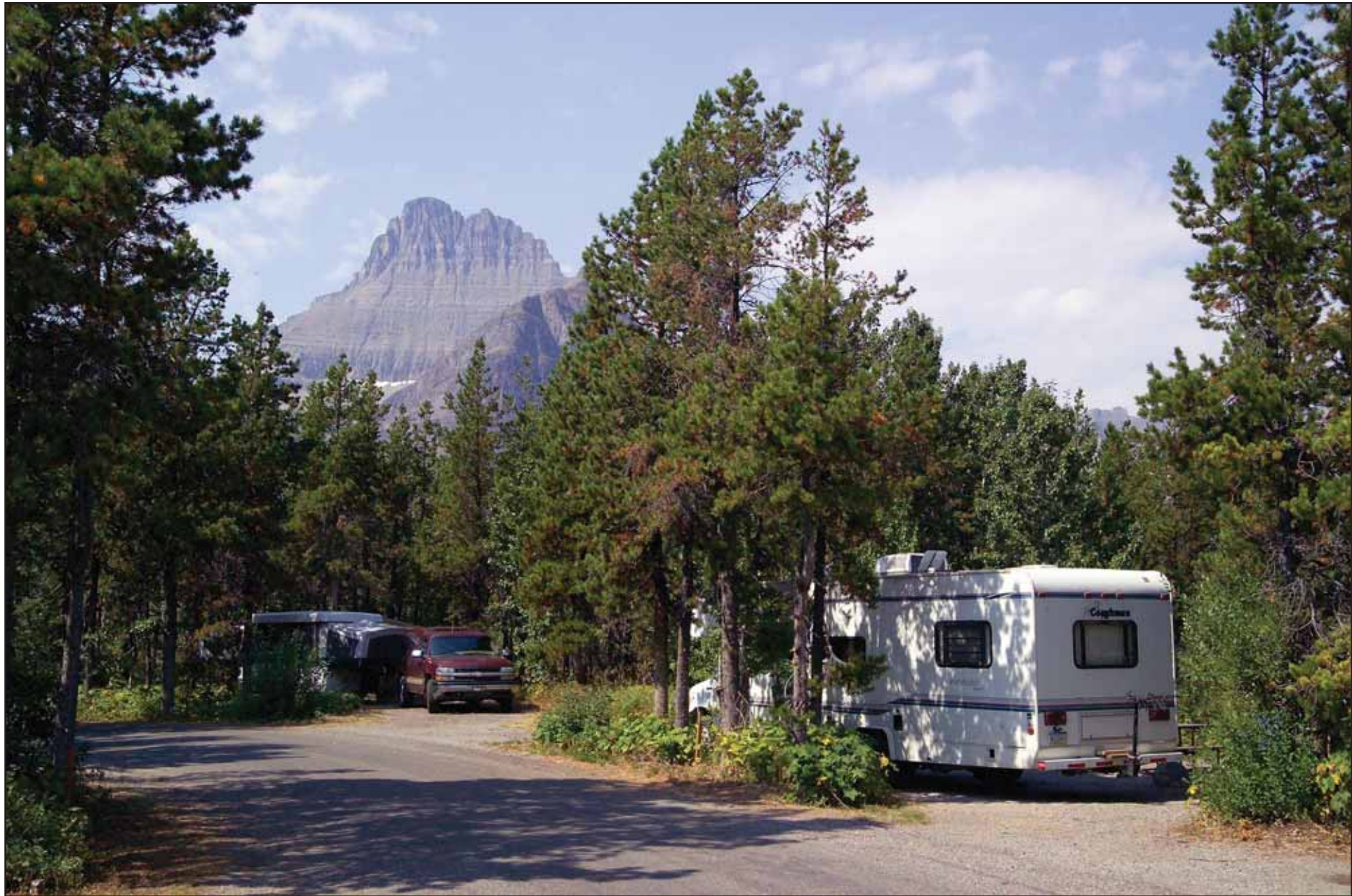
Mt. Wilbur and the Many Glacier Campground

Lucerne Room Evening Program Meet downstairs in the Lucerne Room of the Many Glacier Hotel for this exploration of the facets of Waterton-Glacier International Peace Park. All park visitors are welcome. 45 minutes