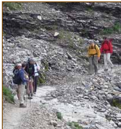
Hiking the Highline Trail