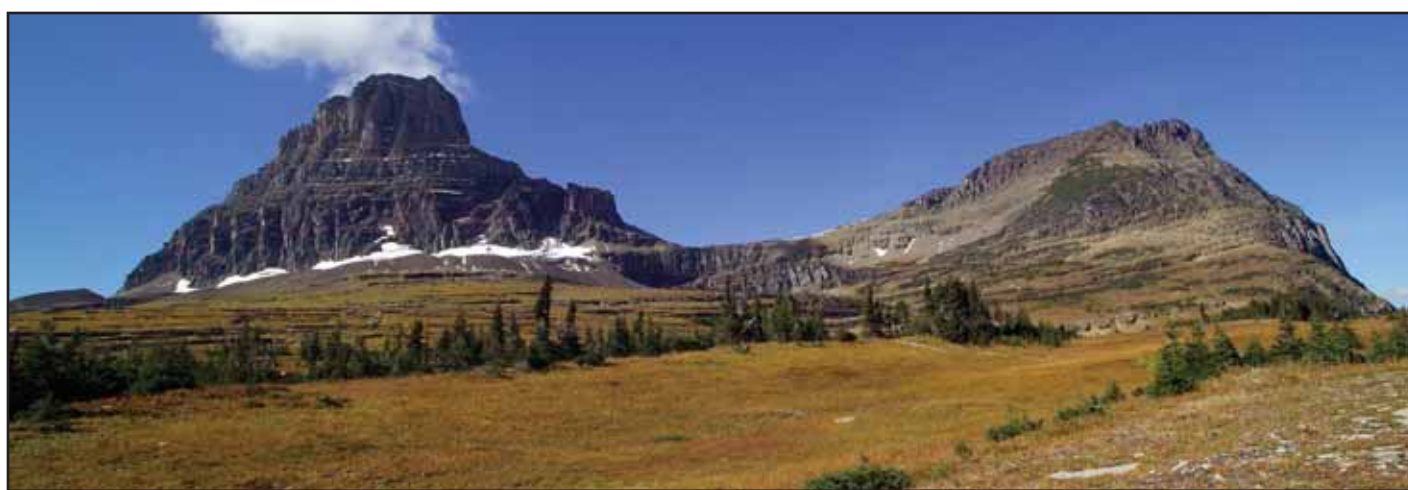
St. Mary Falls, Clements Mountain at Logan Pass, and Aspen