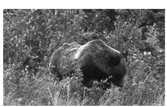
Grizzly bear