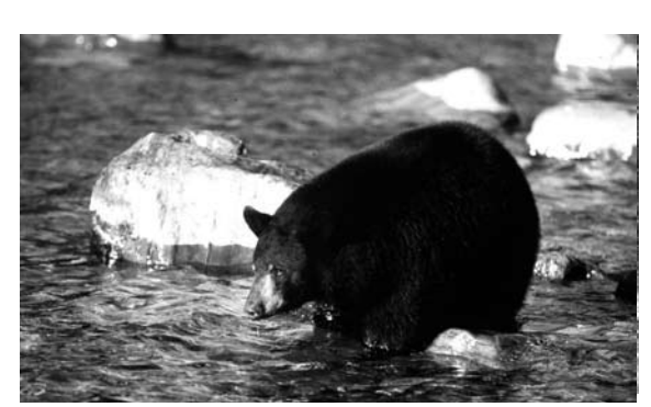
Black bear