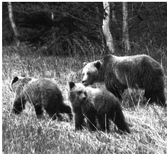
Grizzly Bears Family

Report all bear and mountain lion sightings or encounters to the nearest ranger, campground host, visitor center, or by calling (406) 888-7800.