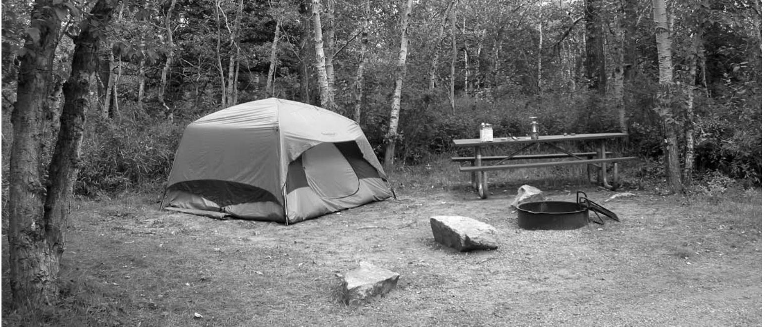
St. Mary Campground

To enhance your enjoyment and assist in protecting Glacier National Park, please read and comply with all campground regulations.