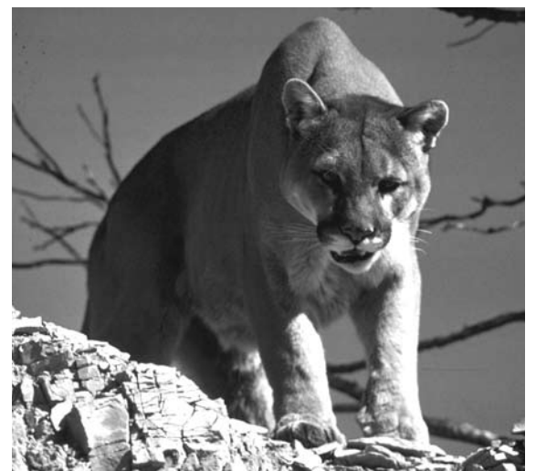
Mountain Lion