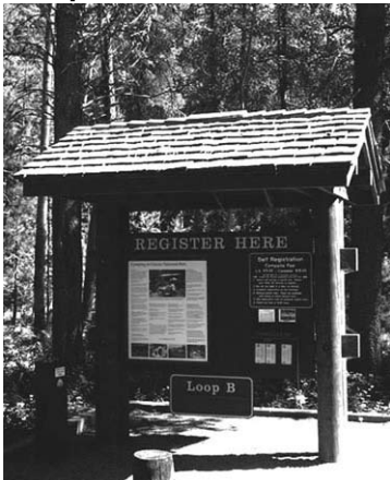
Campground Registration

Camping is permitted only in designated campgrounds.