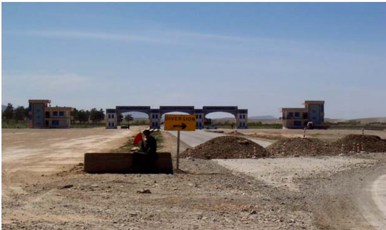
U.S. Army Corps of Engineers' photograph of the segment of Section 5 of the Kandahar-Herat highway in Herat, Afghanistan on which work was suspended. (April 2005)

On October 4, 2005, work was suspended on the last 24 kilometers of Section 5 of the highway leading into Herat, including 4 bridges. Section 5's completion date was also extended from December 31, 2005, to October 17, 2006. 1 Although these actions were taken because of the funding shortages, in our opinion, the Mission's taking ten months to request additional funding also contributed to the need to suspend work on the Kandahar-Herat highway reconstruction activities.