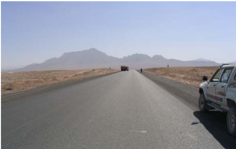
OIG photograph of a segment of Section 4 of the Kandahar-Herat highway in Herat, Afghanistan that had been paved with three layers of asphalt. (October 2005)

Most of the outputs had to be and were completed before construction of the new highway could begin. Of the remaining planned outputs, we considered the construction of the new road surface, which consisted principally of applying three layers of asphalt so that the highway could be open to traffic, to be the key output for answering the audit objective. It was the output most used by the Mission and its implementing partners to track progress.