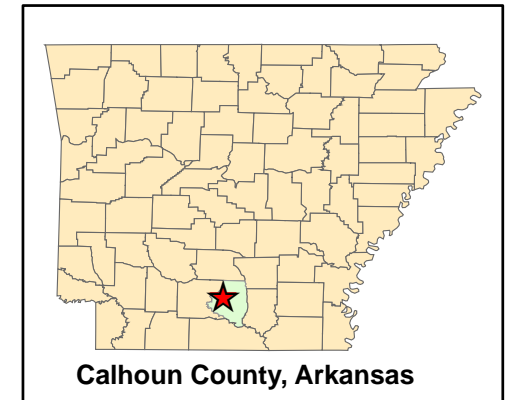
Figure 2 Monitoring Well Locations Shumaker Naval Ammunition Depot