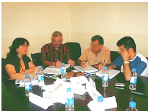
IZDIHAR's Regional Office in Erbil organized a "Training of Trainers" session in August 2006.

IZDIHAR built the "knowledge infrastructure" required by such an operation, by training the course lecturers, providing support materials and organizing the mid-term and final examination.