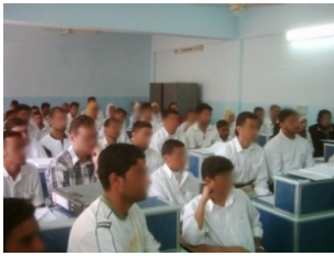
Students attend a lecture on international accounting standards.