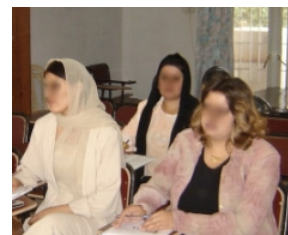
Local businesswomen in Kirkuk learn about microfinance loans.

"Al-Aman" is one of the three indigenous microfinance institutions that USAID has supported with training, technical assistance and grants for loan capital through the IZDIHAR project. USAID is also assisting three international NGOs which are providing microfinance loans in Iraq.