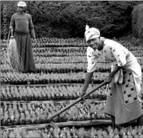
Women working for the Tanzanian Forest Ministry cultivating pine plants in a tree nursery.

Prime recipients: Associates in Rural Development, Inc. (ARD); Development Alternatives, Inc. (DAI); and, Chemonics International, Inc.