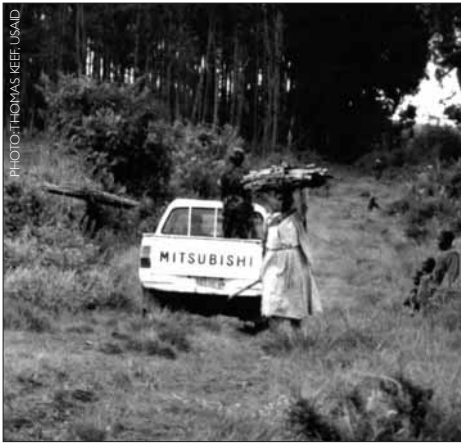
Rwanda's remaining natural forests are under pressure from an expanding population.