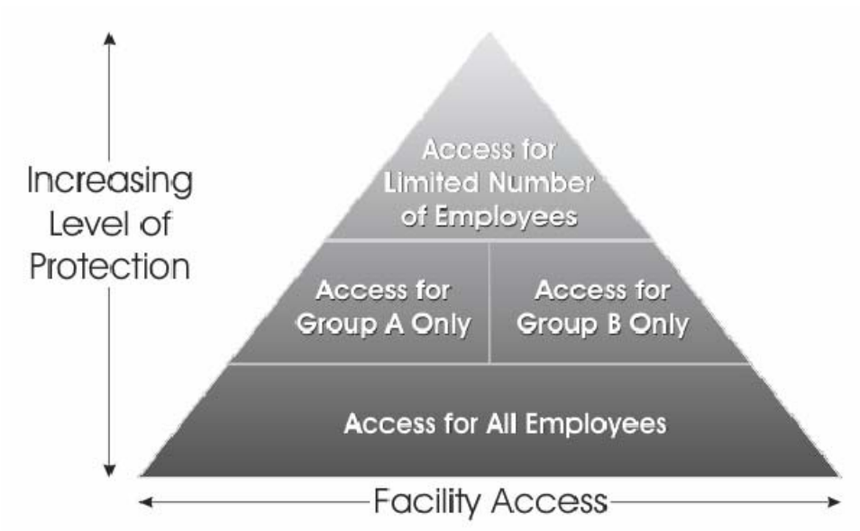
Figure 2. Example of varying employee access levels by sensitivity of the operation. Areas containing the most vulnerable operations should be restricted to a limited number of employees, and these employees should receive background investigations and additional training.