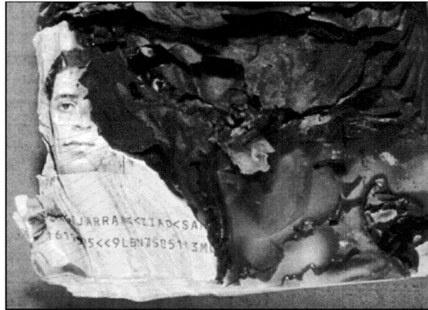
A partly-burned copy of Ziad Jarrah's U.S. visa recovered from the Flight 93 crash site in

In other words, the 9/11 hijackers had been taught what to do to attain successful entry into the United States. The frustrating irony is that at least some of the hijackers could have been denied admission into the United States if critical information had been provided to border officers via lookouts or regarding the passports themselves. Today, we have the ability to provide that information to our border security personnel as long as a passport or verifiable biometric equivalent is required for admission . However, where there is no passport or equivalent biometric travel document required for admission, as is currently the de facto case in the Western Hemisphere, our border personnel have little to no baseline upon which to make an initial judgment about whether a particular individual may pose a terrorist or public safety threat to the United States.