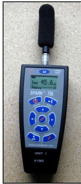
Type II SLM