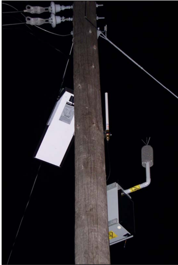
Permanent automated wireless noise monitoring system (note solar cell, antenna, transmitter, and microphone)

The need obviously exists to tailor the type of equipment utilized to the complexity of the project and its construction noise monitoring requirements. In performing valid construction noise measurements, the following factors should generally be considered: