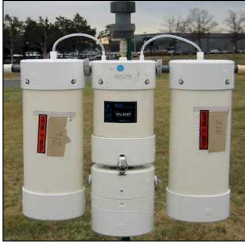
Portable air sampler in the field

The PAS is the industry standard equipment for collecting PM10 readings, in units of \mu\text{g}/\text{m}^3 .