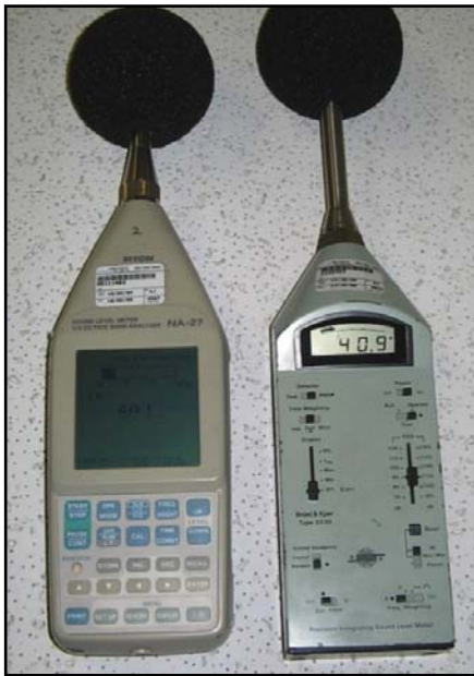
Type I SLMs