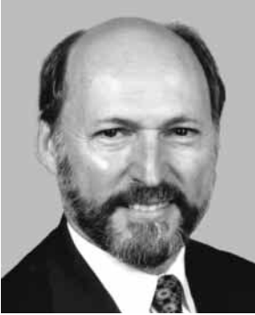
Alan Hantman Architect of the Capitol