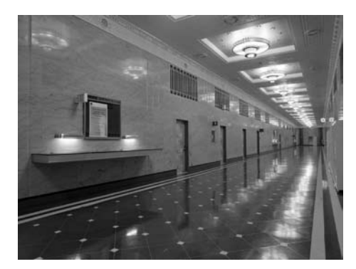
FIGURE 5 GSA Building Preservation Plans identify spaces of architectural importance and character-defining features, including historic light fixtures, to be preserved.

Every successful GSA historic building project begins with review of the specific building's Building Preservation Plan (BPP) or Historic Structure Report (HSR) to ensure that GSA teams involved in developing project requirements and overseeing design and execution are well informed on the building's preservation goals at the earliest stages of project planning and design. The BPP or HSR identifies spaces of architectural importance and character-defining features, such as historic light fixtures, to be preserved. BPPs and HSRs also outline restoration goals for altered public spaces, sometimes including original detail drawings of original fixtures as a basis for replication.