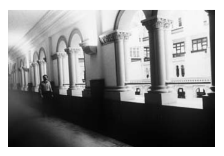
FIGURE 17 Contemporary sconce lights illuminate walls and ceilings in corridors where daylight originally served as the principal light source for this 19th-century post office. The opaque shades of the sconces reflect light against the walls of the corridor,

When historic fixture modifications and task lighting cannot adequately address ambient lighting needs, explore additional light-supplementing options that will not compete with historic lights. In historically significant spaces, supplementing chandeliers, pendant lights or other ceiling mounted lights with wall mounted sconces, uplights mounted on furniture, or freestanding lamps is preferable to installing additional ceiling fixtures.