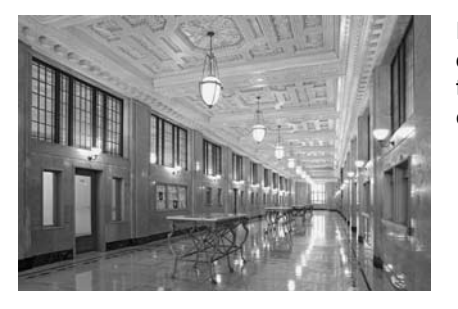
FIGURE 4 Good lighting depends on effective distribution of natural and electric light.

GSA's Green Building program, initiated in 1999 and renamed the High Performance Green Buildings program in 2008, provides guidance on sustainable design, energy efficiency, resource conservation, and workspace quality for GSA repair and alteration projects of all scales. There are many ways that energy reduction and workspace needs can be met while preserving character-defining historic light fixtures and making the most of inherent energy conserving features in historic buildings. Lighting upgrades and interior renovation projects often provide opportunities to remove inappropriate alterations and restore compromised spaces to improve tenant satisfaction and make a historic building more marketable.