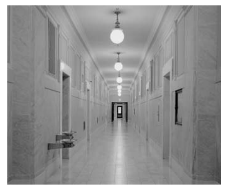
FIGURE 6 The simplest method of reducing energy use in spaces containing historic light fixtures is to replace the incandescent bulbs with compact fluorescent lamps. Reballasting increases the energy savings.

The simplest method of reducing energy use in spaces containing historic light fixtures with incandescent bulbs concealed by translucent or opaque globes, shades, or lenses, is to replace the incandescent bulbs with compact fluorescent lamps. Changing to a fluorescent source with color temperature as close as possible to that of the incandescent lighting will help to ensure against lighting color changes that may have a negative impact on the appearance of historic finishes and features.