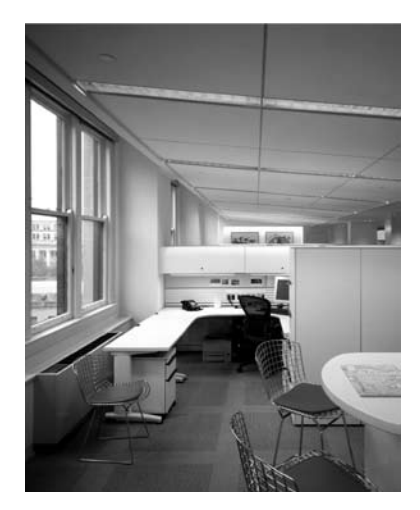
FIGURE 11 Preserve window opening clearance by recessing suspended ceilings from windows or configuring ceilings to slope upward toward the window head or step down toward the building interior.

Since the amount of light penetrating a room is limited by the height of the opening, it is important that windows are not partially blocked by suspended ceilings, wall partitions and other alterations. Design suspended ceilings to be recessed from window openings by creating pockets or soffits around windows or configuring ceilings to slope upward toward the head of the window or step down toward the corridor to accommodate ductwork and other building systems.