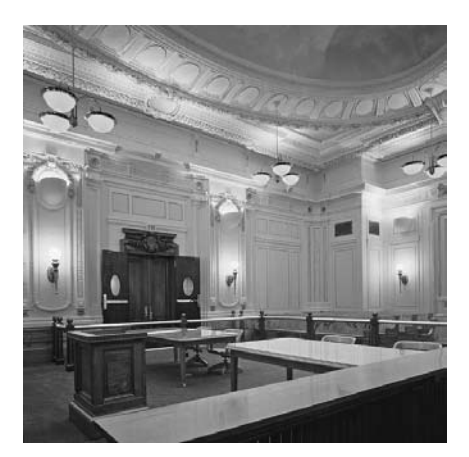
FIGURE 18 Quietly designed sconces maintain visual focus on the historic chandeliers and decorative finishes embellishing this historic courtroom.

rather than beaming light down on corridor occupants, subtly maintaining the visual dominance of the skylit atrium the corridors overlook.