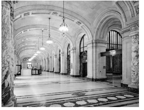
FIGURE 1 Electric lighting thoughtfully supplements daylight in this historic lobby.

To ensure that GSA's preservation and performance expectations are met, specifications for historic lighting replication, modification, or supplementation need to include requirements for product data, sample review and mock up test installation.