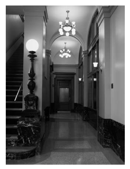
FIGURE 3 Interior upgrade projects often provide opportunities to restore compromised spaces and make a historic building more marketable.

FIGURE 2 Variable light levels and multiple light sources contribute to the historic character and elegance of this early 20th century courtroom.