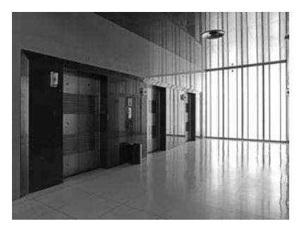
FIGURE 13 Reflective surfaces contribute significantly to lighting levels and quality in corridors and other public spaces.

Reflective finishes such as polished stone walls and terrazzo floors can contribute significantly to lighting levels in corridors and other public spaces and also to the perception that these spaces are adequately lit. Accordingly, installation of carpeting or light absorbing materials outside of office areas where they are necessary for workspace noise reduction should be discouraged.