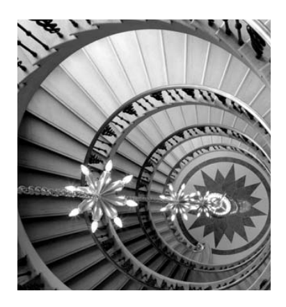
FIGURE 7 Installing highefficiency incandescent (HEI) lamps in historic exposed bulb fixtures reduces energy use by 50-75 percent with no impact on the appearance of the fixture.

Historic chandeliers featuring exposed incandescent bulbs can be upgraded to receive High Efficiency Incandescent (HEI) lamps that use 25% of the energy standard incandescent bulbs use (available in 2010.) Historic fixtures may also be remodified to include additional light sources, such as light emitting diodes (LEDs) or fiber optics where modifications can be done inconspicuously and lamp temperatures (color) will be compatible. The use of color-incompatible lamps, such as halide, as the sole light source is not appropriate, given differential color shifting that occurs as lamps age. Select lamps providing color temperatures as close as possible to that of original lighting. Lighting consultants specializing in historic lighting are best qualified to analyze existing historic lighting (foot candles and temperature) and identify appropriate alternatives.