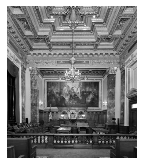
FIGURE 2 Variable light levels and multiple light sources contribute to the historic character and elegance of this early 20th century courtroom.

Ceremonial corridors, stairways and public spaces were often embellished with custom-fabricated pendant lights, chandeliers, or sconces hung from ornamental ceilings and walls. Desk lamps and torchieres supplemented ceiling lights in standard offices and courtrooms to put light where it was most needed.