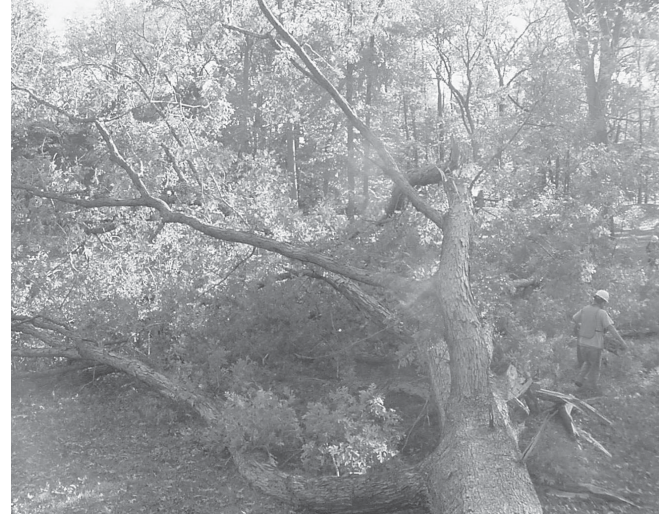
Damage from Hurricane Isabel. Many large trees fell in the park during the 2003 storm.

Our vision for 2016 can be realized with our strongest assets: the men and women of the National Park Service, and the partners who work side by side with us. National parks benefit from a passionate workforce. The Service will recruit and retain a workforce that reflects the face of