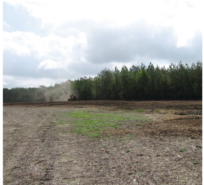
Contractors removed 13 acres of trees at Glendale, recreating the exact dimensions of an historic farm field that witnessed heavy fighting.

This summer the park completed another phase of landscape rehabilitation at the Malvern Hill and Glendale/Fraser's Farm battlefields. The newest work entailed the removal of 28 acres of trees (12 acres at Malvern Hill and 13 acres at Glendale), and 3 acres of understory clearing at Malvern Hill. The purpose is to restore the scene as closely as possible to its 1862 appearance. Visitors to the sites will better appreciate the role of