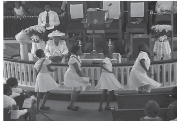
Children of the community portrayed the Juvenile Department of the I.O. of St. Luke during the July 15 th birthday celebration.