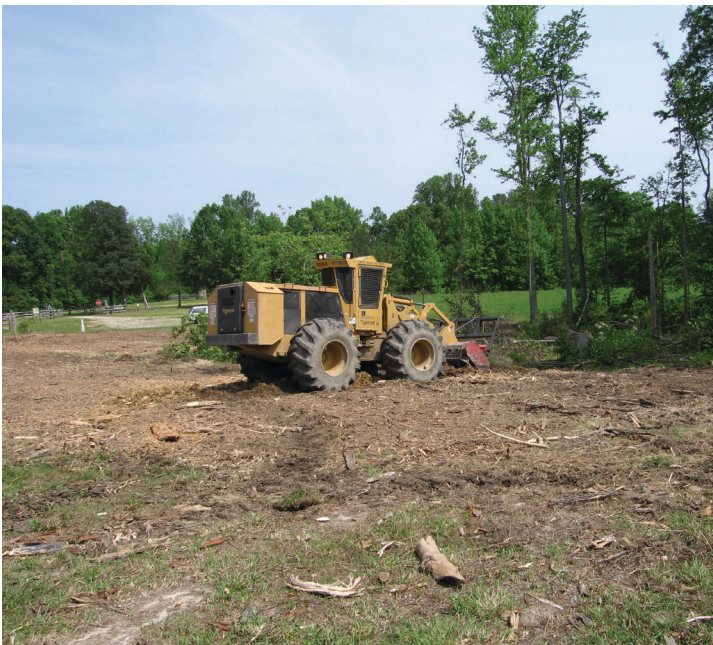
At Malvern Hill 15 acres of trees and understory were cleared. After the trees were removed, stumps were ground and the surface raked and seeded.