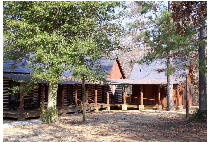
Richmond National Battlefield Park log cabin, before and after. The log cabin served as the park's original headquarters building and will soon house the Fort Harrison Visitor Center.

The log cabin structure at the Fort Harrison unit of Richmond National Battlefield Park was built in 1930 by the Richmond Battlefield Parks Corporation, the private group that first started buying battlefield land around Richmond, for its headquarters. The structure became the first headquarters and visitor center for the park when Congress authorized its establishment in 1936 and remained as such until 1959 when the functions were moved to Chimborazo.