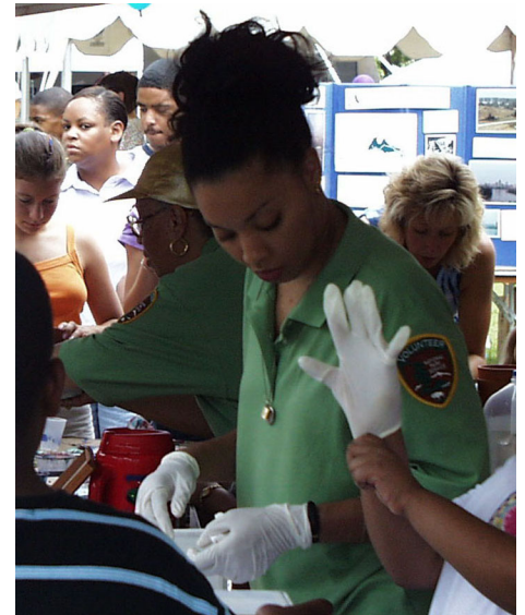
Volunteers from Maggie L. Walker National Historic Site help out at a booth during one of many special events the park participates in.