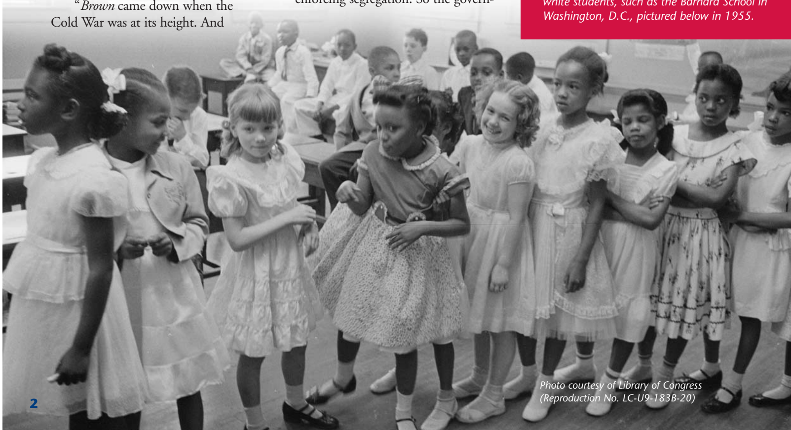
Photo courtesy of Library of Congress (Reproduction No. LC-U9-183B-20)

Although the Brown mandate initially faced some resistance, schools around the country immediately began integrating black and white students, such as the Barnard School in Washington, D.C., pictured below in 1955.