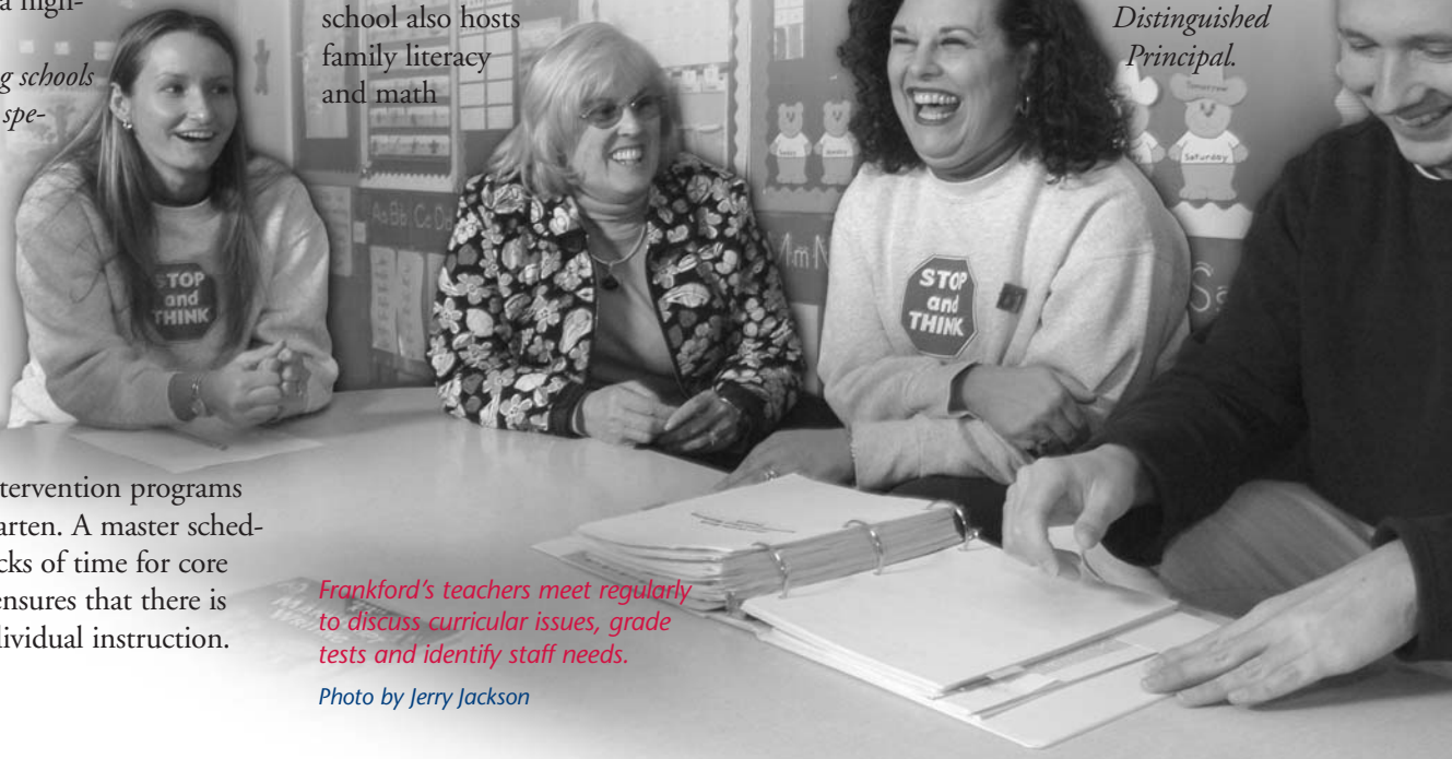
Frankford's teachers meet regularly to discuss curricular issues, grade tests and identify staff needs.