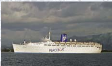
Promoting best practices for maritime industries