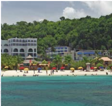
Promoting sustainable tourism