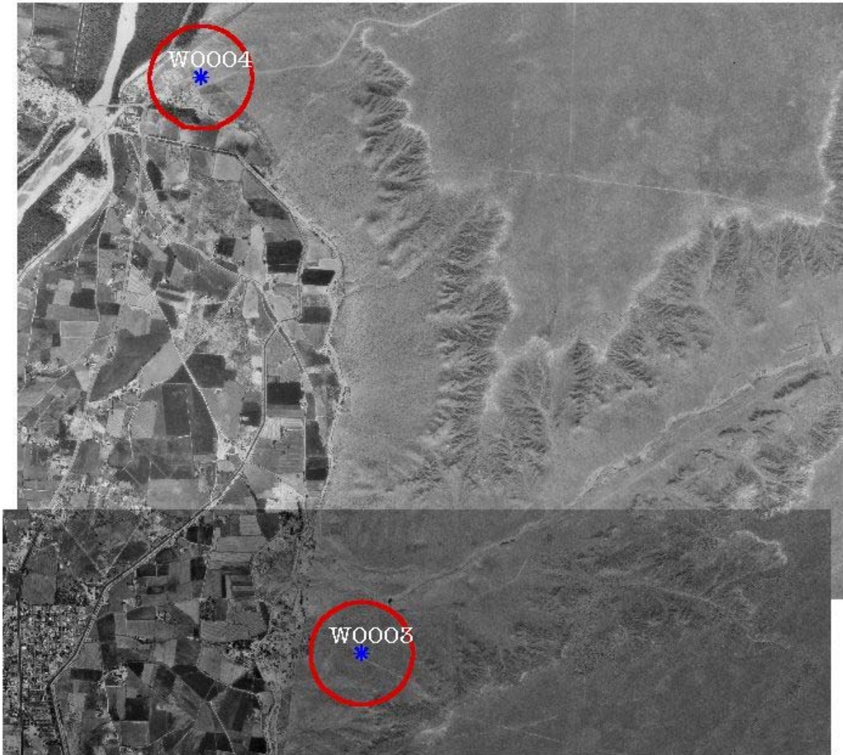
Figure 1: Isleta Pueblo/Eastside