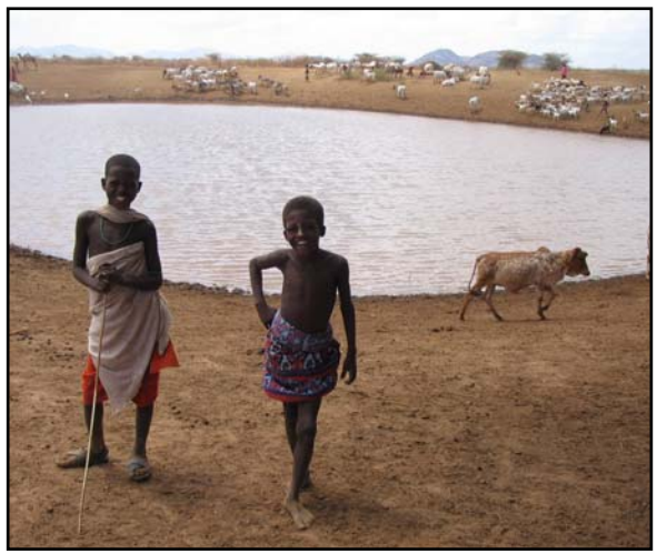
Young herders bring cattle to a USAID/OFDA-funded water catchment in northern Kenya.

Since 1997, USAID/OFDA has provided nearly $32 million in humanitarian assistance to Kenya. More than half of this aid has focused on emergency WASH services, while additional humanitarian programs have addressed health, nutrition, and agriculture and food security needs. In response to recurrent droughts and floods, USAID/OFDA implementing partners have rehabilitated water and sanitation facilities, assisted with livestock restocking, provided oral rehydration therapy and cholera medicines, supported cash-for-work programs and other livelihoods activities, and delivered emergency relief items to affected populations across the country.