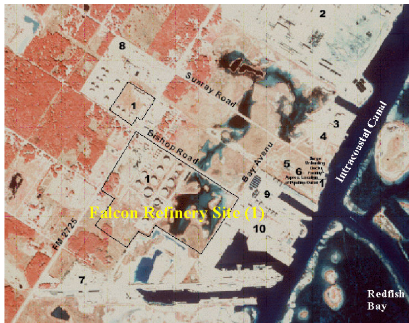
Falcon Refinery aka National Oil Recovery Corporation Ingleside, San Patricio County, Texas TXD 086 278 058