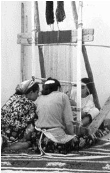
Traditional Artisans and Entrepreneurs