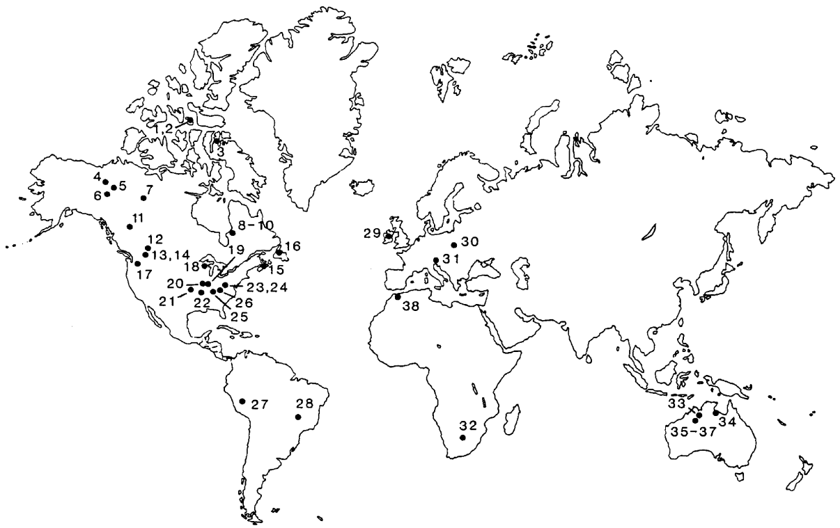
Figure 1. Location of MVT deposits and districts throughout the World: 1, Polaris; 2, Eclipse; 3, Nanisivik; 4, Gayna; 5, Bear-Twit; 6, Godlin; 7, Pine Point district; 8, Lake Monte; 9, Nancy Island; 10, Ruby Lake; 11, Robb Lake; 12, Monarch-Kicking Horse; 13, Giant; 14, Silver Basin; 15, Gays River; 16, Daniels Harbour; 17, Metaline district; 18, Upper Mississippi Valley district; 19, southeast Missouri district (Old Lead Belt, Viburnum Trend, Indian Creek); 20, central Missouri district; 21, Tri-State district; 22, northern Arkansas district; 23, Austinville; 24, Friedensville; 25, central Tennessee district; 26, east Tennessee district; 27, San Vicente; 28, Vazante; 29, Harberton Bridge; 30, Silesian district; 31, Alpine district; 32, Pering; 33, Sorby Hills; 34, Coxco; 35-37, Lennard Shelf district (Cadjebut, Blendvale, Twelve Mile Bore); 38, El-Abad-ekta district. Adapted from Sangster (1990).

that the acid-buffering potential of typical carbonate host rocks controls the mobility of zinc, cadmium, iron, lead, and other metals. However, the influence of alteration halos, regional aquifers and karst, variable iron sulfide mineral content, climatic influences, and the presence of various trace elements in ore have not been adequately evaluated. Surface disturbance: MVT deposits characteristically are in districts that are distributed over hundreds of square kilometers. The widespread distribution of MVT deposits within a region requires a regional approach to environmental studies. The Southeast Missouri lead district covers more than 2,500 square kilometers, the Tri-State district is at least 1,800 square kilometers, the Pine Point district is more than 1,600 square kilometers, the East Alpine district is about 10,000 square kilometers, and the Upper Mississippi Valley district is about 7,800 square kilometers. Numerous open pits are present within some districts, especially in abandoned districts such as the Tri-State district, Okla., Mo., and Kans. Modern mining techniques return most waste rock to underground workings; surface tailings and mineral processing facilities pose the most serious environmental concerns.