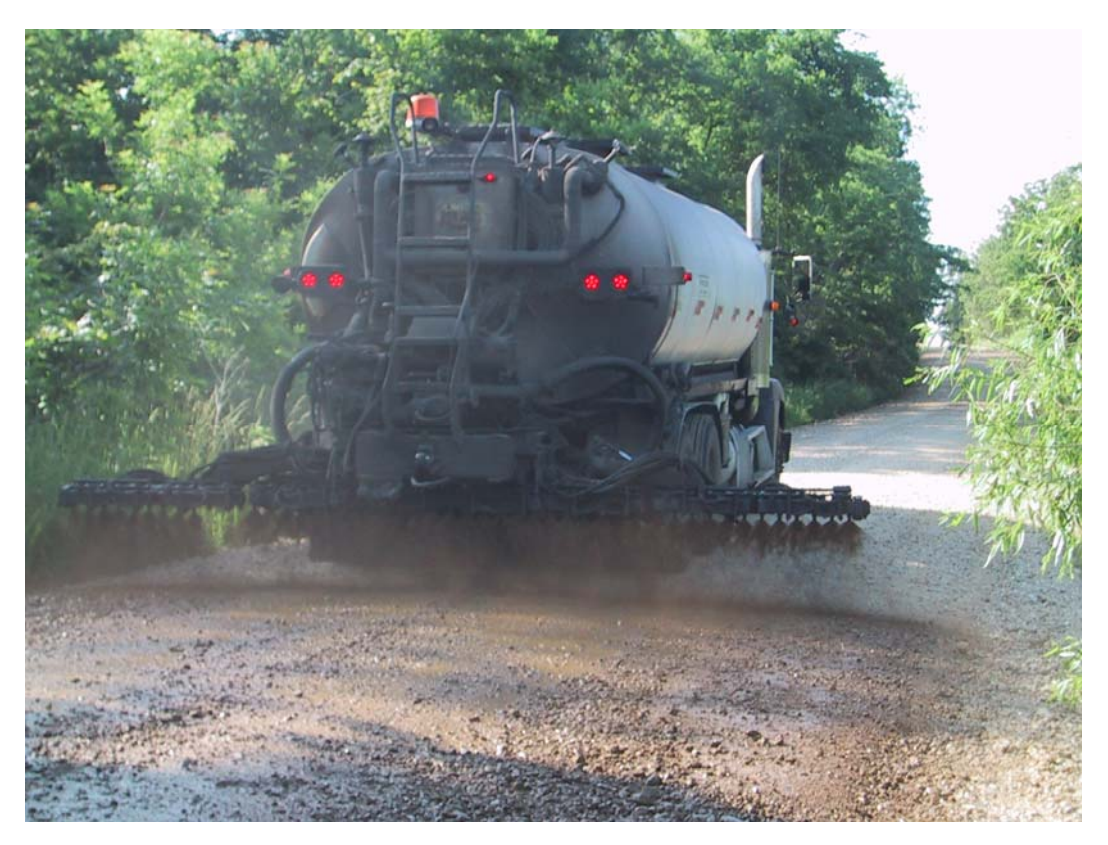
Figure 2. Application of PetroTac product at FLW