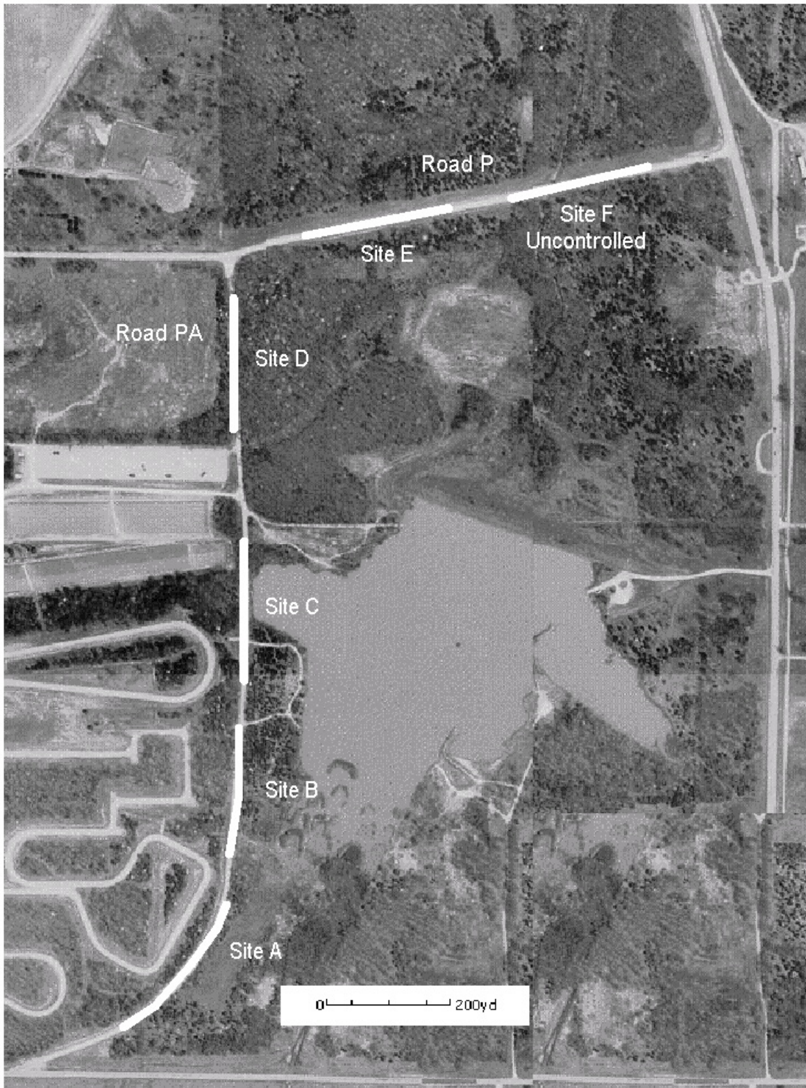
Figure 1. Test locations at FLW