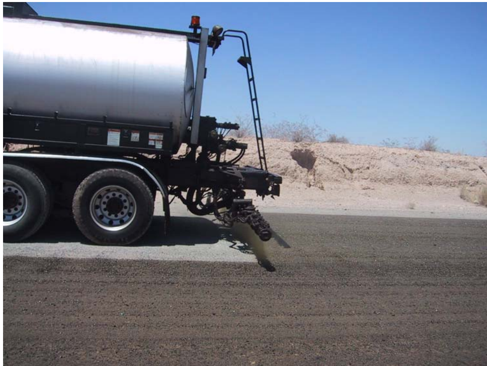
Figure 4. Application of EK35 product at MC