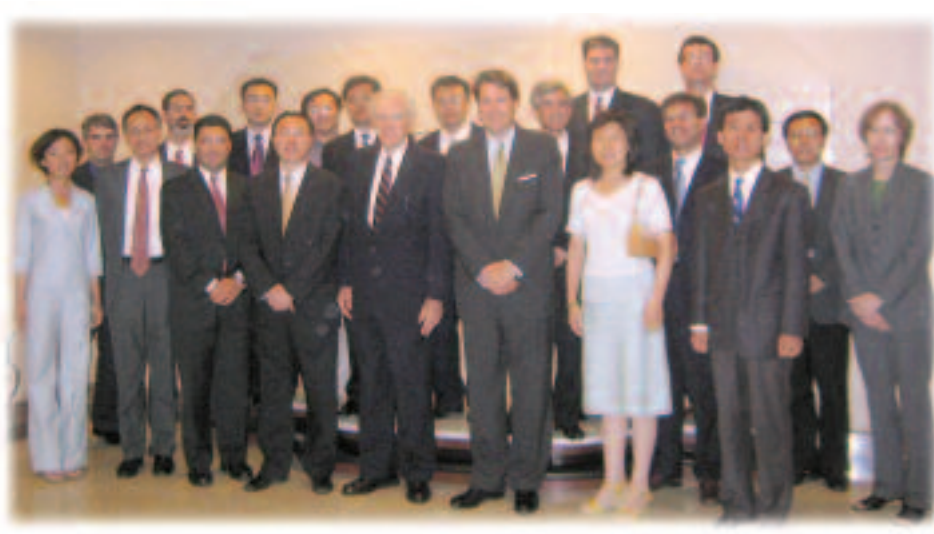
First-ever meeting of senior U.S. and Chinese government officials to discuss China's recent efforts to develop a comprehensive competition law. Beijing, China, July 2004.