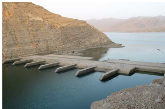
As part of the Afghanistan infrastructure program, the Agency will repair two Units at the Kajakai Hydropower Plant shown above, bringing electricity to 36,000+ people