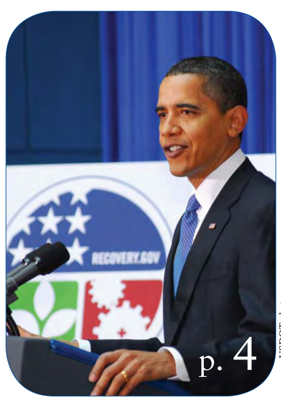
President Obama speaking at USDOT

About the cover: From Petri dish to fuel tank—researchers participating in the Commercial Aviation Alternative Fuel Initiative (CAAFI) are making strides in creating biofuels that could help ease aviation's reliance on fossil fuels.