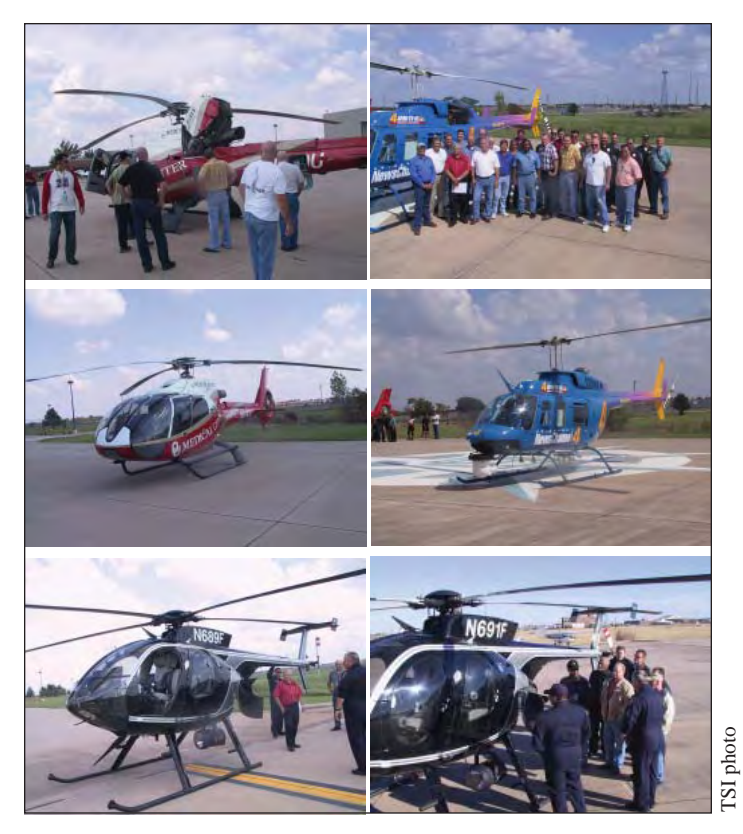
Students become familiarized with various helicopter types during TSI's hands-on Rotorcraft Accident Investigation Course

The course is fast paced, beginning day one with a comprehensive review of rotorcraft flight characteristics and aerodynamics. Follow-on training days include in-depth helicopter systems review, hazards unique to rotorcraft flight, multiple helicopter accident