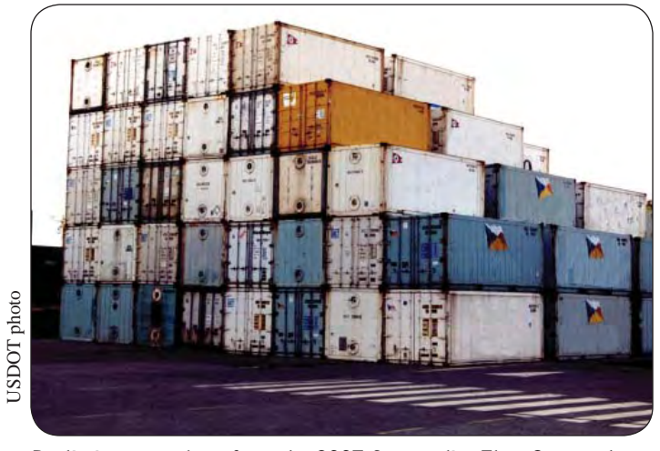
Preliminary numbers from the 2007 Commodity Flow Survey show that, when measured by weight, trucking and rail were the most used modes of freight transportation.

Final data will be available in December 2009.