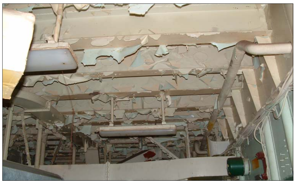
Exfoliating ceiling paint on the ex-USS Oriskany before being cleaned.

For most types of candidate vessels for reefing, the paint-related contaminants of concern are limited to exterior hull coatings below the water line. These hull coatings consist primarily of anti-fouling (AF) agents (biocides) such as copper, organotin compounds, and zinc.