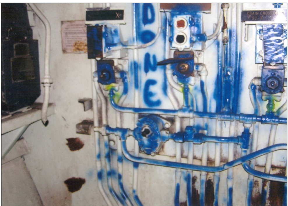
Flushed hydraulic system onboard the ex-USS Oriskany.