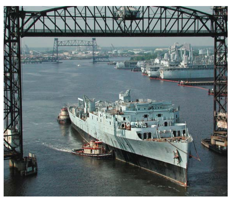
Ex-USS Spiegel Grove, once a MARAD vessel, under way to Florida Keys for final sinking preparations.