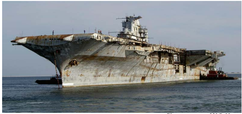
Ex-USS Oriskany arriving at NAS Pensacola, Florida. March 23, 2006.

If the narrative clean-up goals provided in this document cannot be economically achieved, for example because of very significant amounts of materials of concern on the vessel, then the vessel would not be a good candidate for reefing. The methods, approach, and level of effort for clean-up, as well as worker safety concerns, are directly dependent on the vessel's condition and the amount of materials of environmental concern that are found aboard. Vessels where clean-up could pose potential worker safety risks or could incur high costs may not be good candidate vessels for reefing.<sup>2</sup>