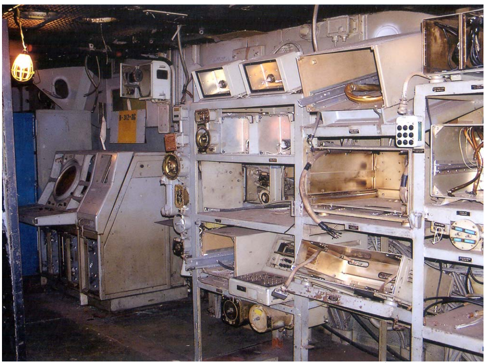
Ex-USS Oriskany electronic equipment stripped of capacitors and transformers.