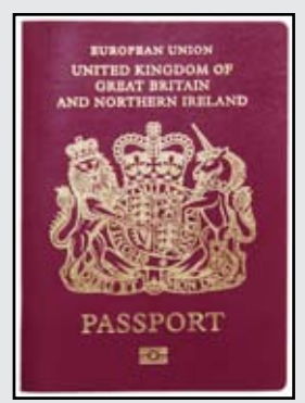
U.S. and Foreign government-issued passports