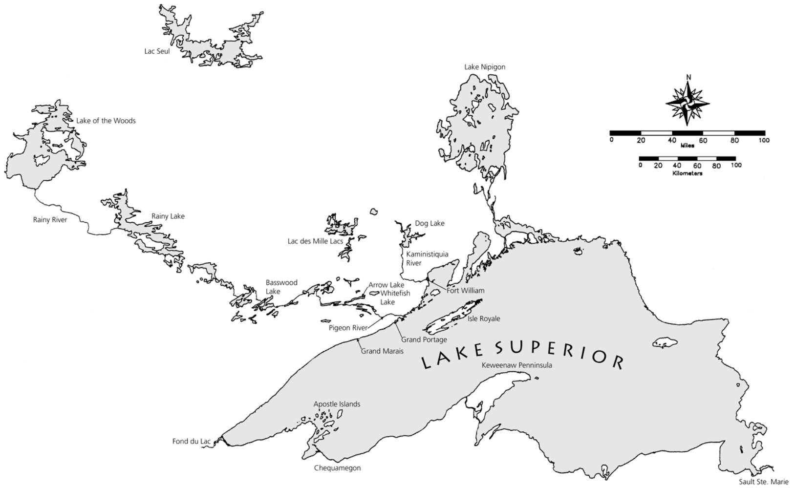
Lake Superior and the border lakes area.