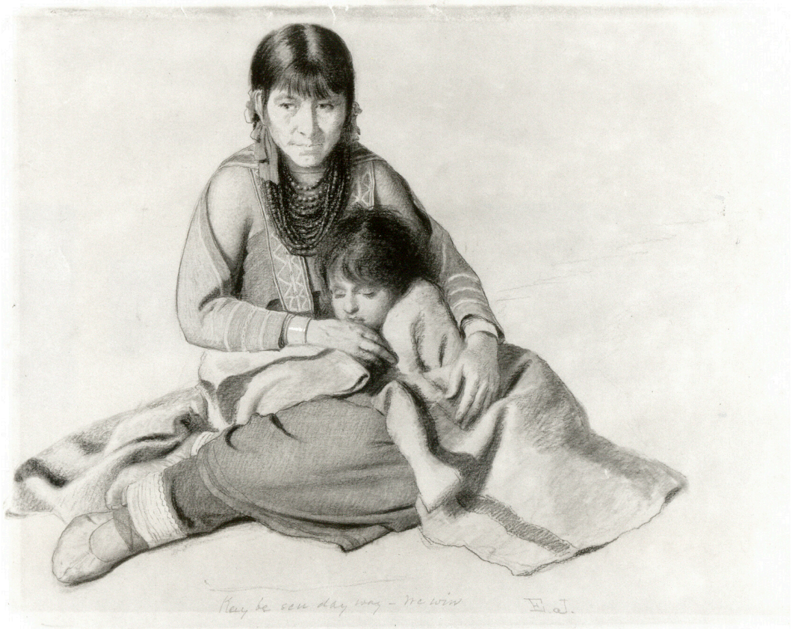
"Kay be sen way We Win," painted by Eastman Johnson in 1857. Note the many trade items worn by mother and child. It is charcoal and crayon on paper and printed with permission from the St. Louis County Historical Society, Duluth, Minnesota.