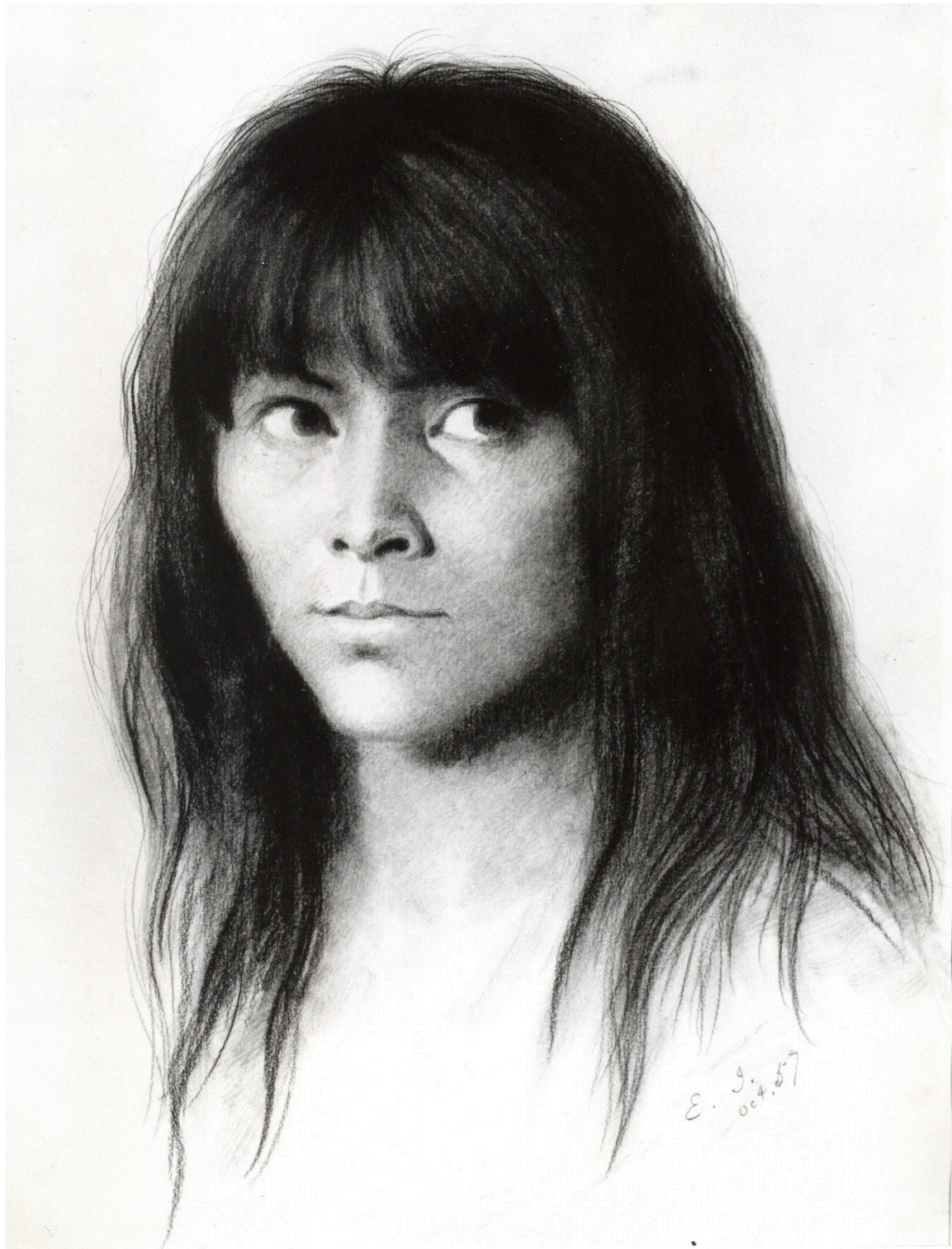
Untitled, painted by Eastman Johnson in October 1857 at Grand Portage. It is charcoal and crayon on paper and printed with permission from the St. Louis County Historical Society, Duluth, Minnesota.