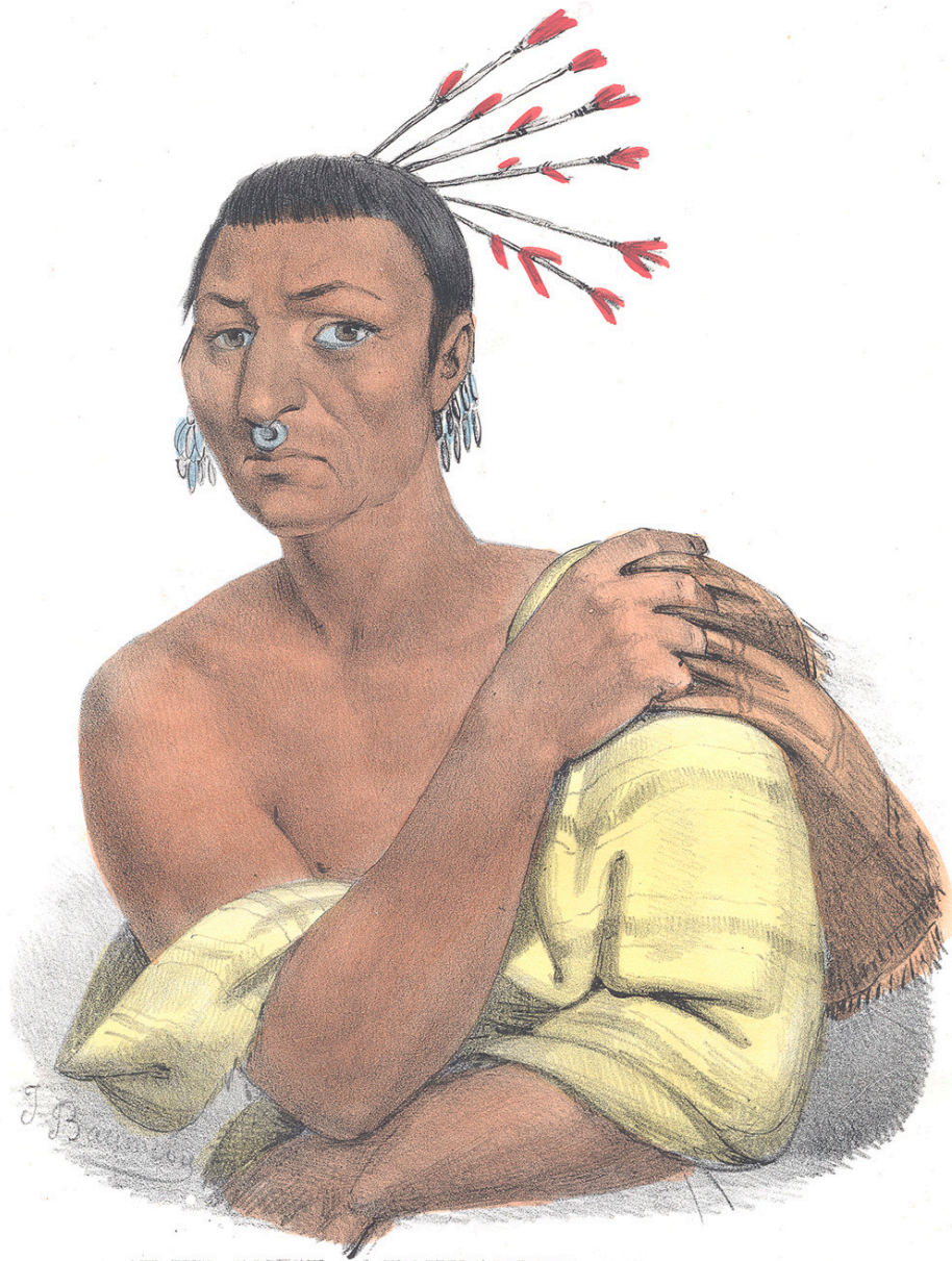
AT-TE-CONSE or the YOUNG REIN DEER