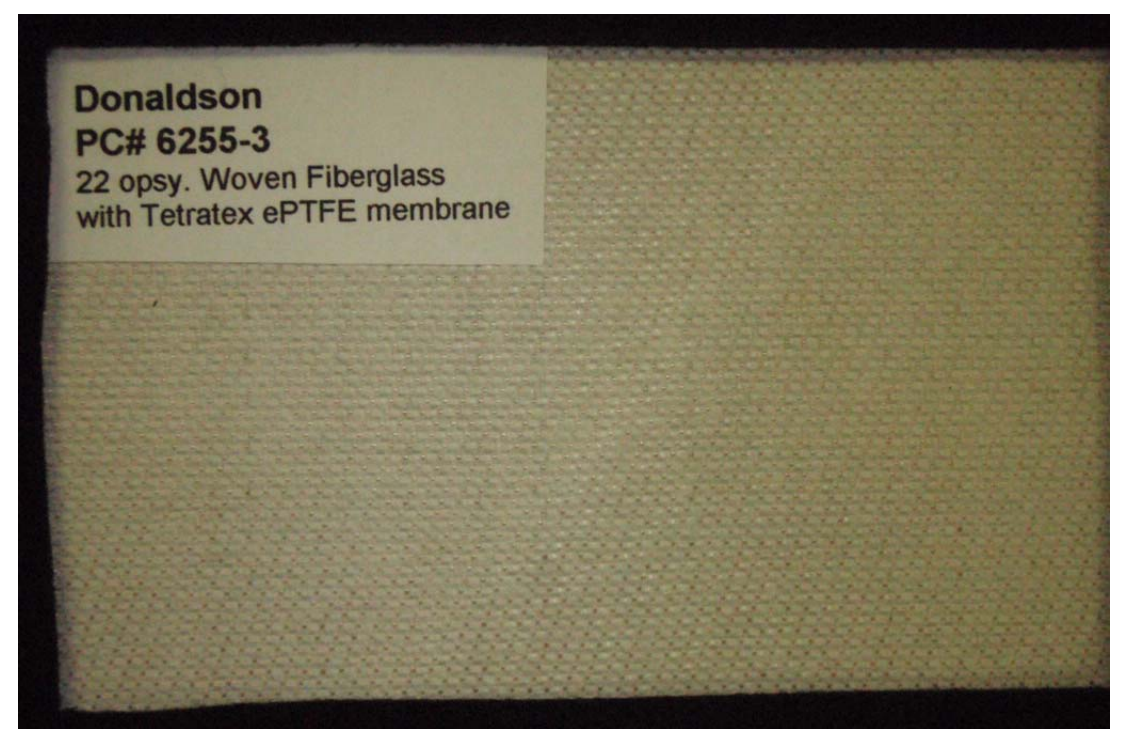
Figure 1. Photograph of Donaldson Company, Inc.'s Tetratec # 6255-3 Filtration Media