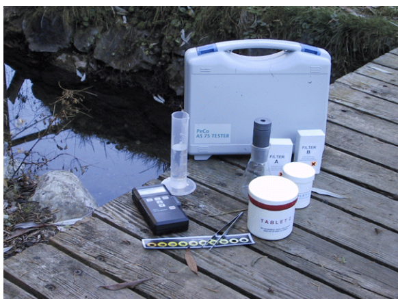
Figure 2-1. Peters Engineering AS 75 Arsenic Test Kit

The AS 75 consists of the PeCo test kit, which measures the color change of a filter by visual comparison to a color chart, and an AS 75 tester, which measures the color change of the filter electronically. The AS 75 includes a 100-mL reaction bottle (Erlenmeyer flask), two filter holders, a 50-mL volumetric cylinder, a 10- and a 1-mL pipette, tweezers, gloves, two color charts, filters, cotton, a nine-volt battery, and chemicals and reagents (in tablet form) for 20 tests. The AS 75 can be used for 50-, 10-, 5-, or 1-mL samples; in this test all samples were 50 mL. The AS 75 tester is a hand-held, battery-powered electronic device recommended for determining low concentrations of arsenic in the field.