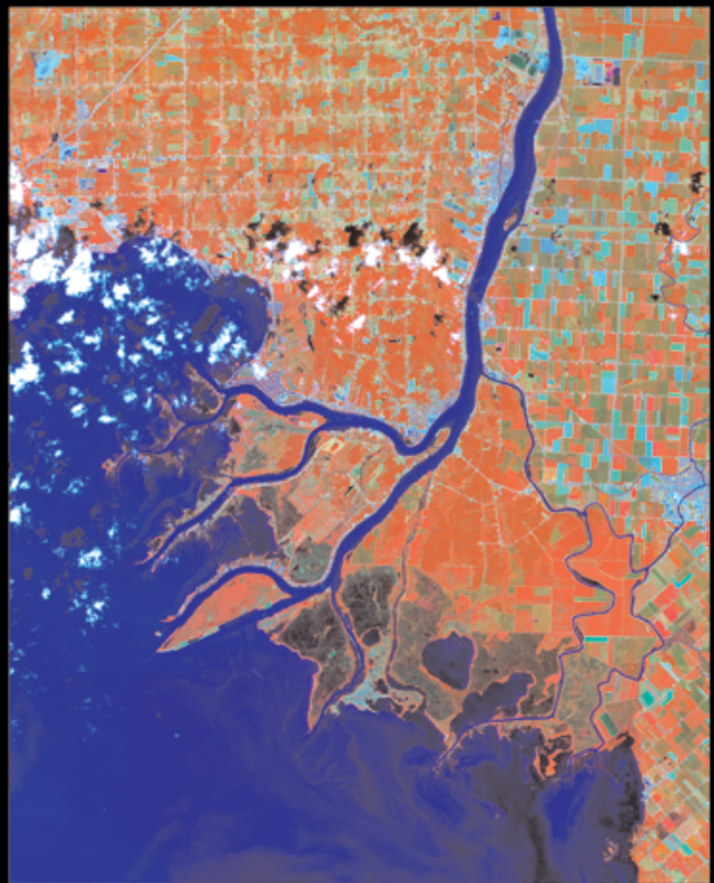
Image below: R, G, B band combination = 4, 7, 1 Scale = 1:52,000 Nominal spatial resolution = 15 meters

Image to the right: R, G, B band combination = 4, 3, 2 Scale = 1:117,000 Nominal spatial resolution = 30 meters