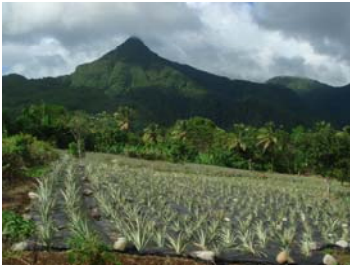
Improving production for export to select markets in Miami under the Caribbean Trade Expansion program (CTEP).