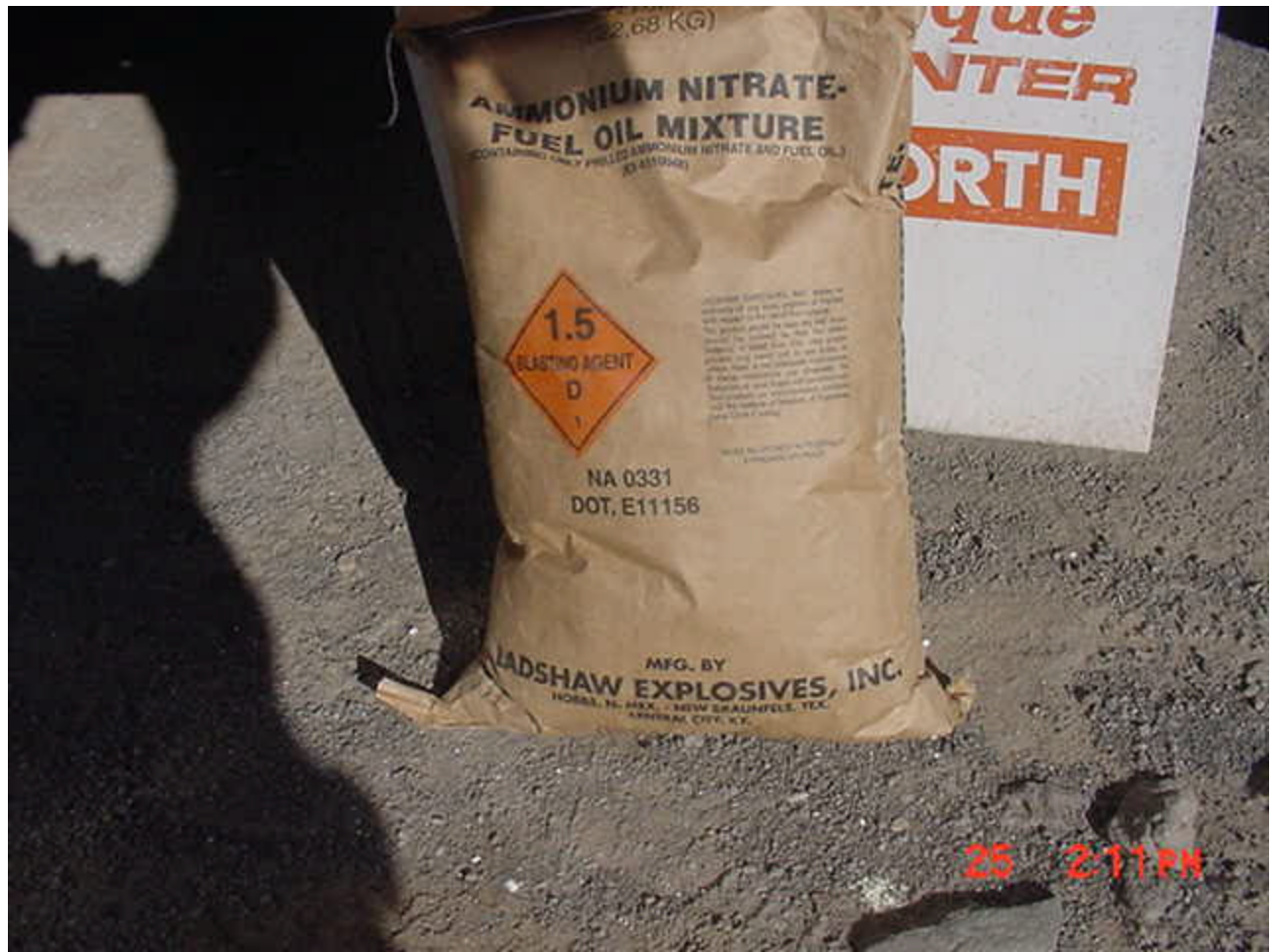
50-pound bag of Bradshaw Explosives ANFO