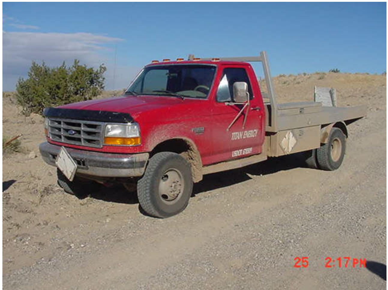
White Ford F-350 diesel power stroke flatbed Titan Energy Truck stolen in connection with Explosives Theft with same markings and configuration as this Titan Energy truck