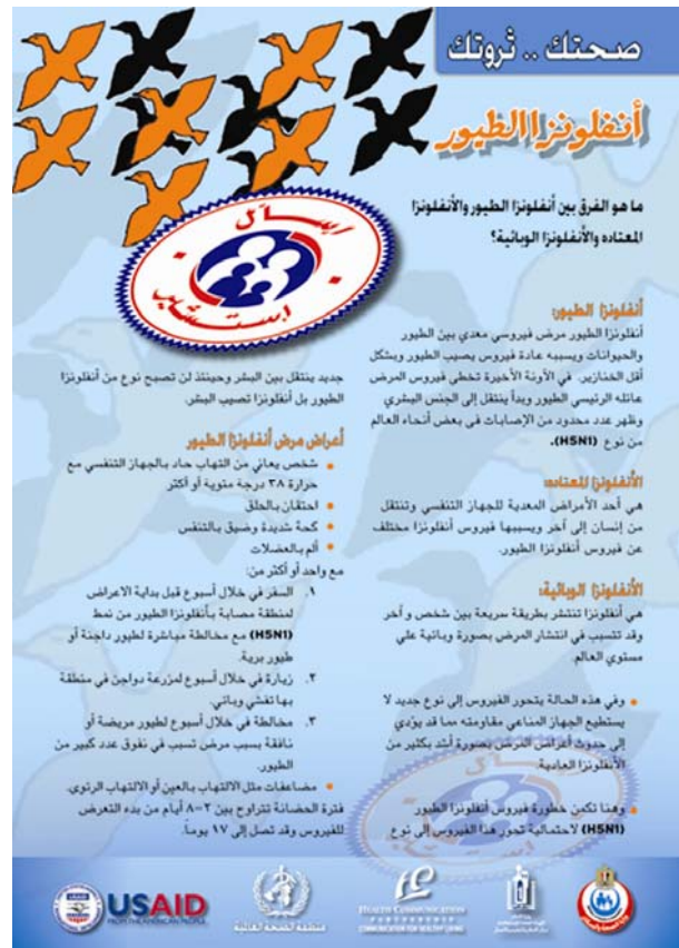
An avian influenza fact sheet used for USAID's outreach activities in Egypt. USAID's efforts in Egypt, conducted with assistance from Johns Hopkins University, led to the country's first national communications campaign on avian influenza.

In addition to the activities in the countries described above, USAID has also provided bilateral support to Afghanistan, Bangladesh, India, Jordan, Nepal, Pakistan, the Philippines, East Timor, and West Bank/Gaza for avian influenza activities.