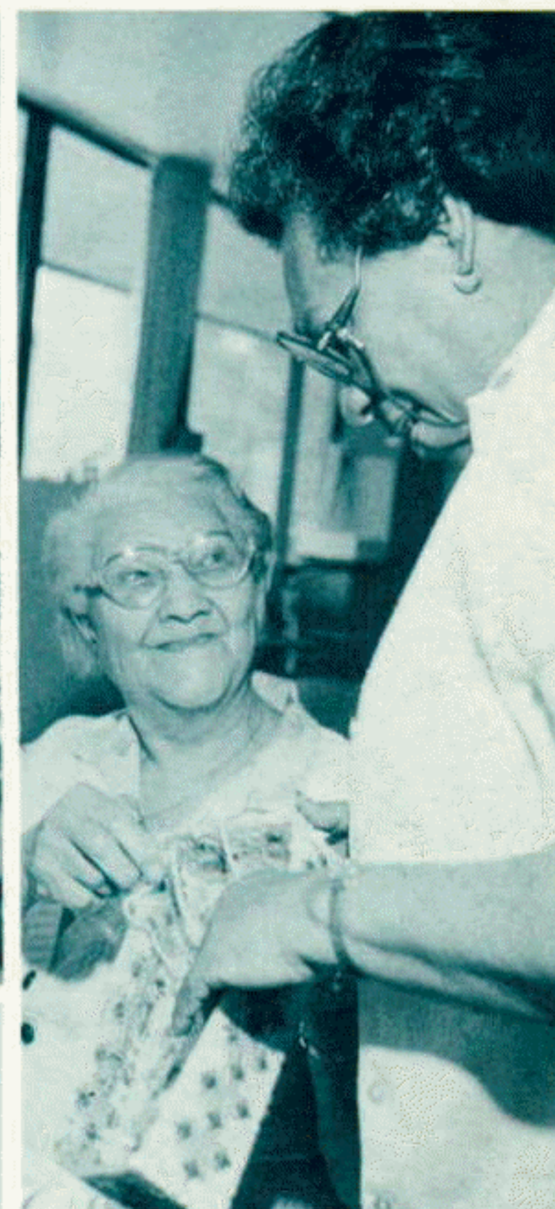
Older Americans Month 'For age is opportunity no less than youth itself.'-- Longfellow