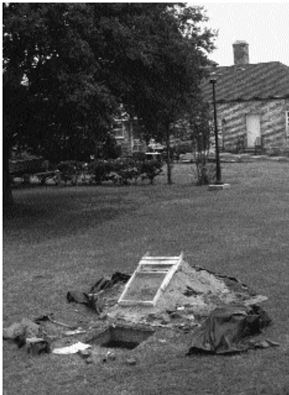
To demonstrate National Register eligibility at the early-19th-century fortification of Fort Johnston, only a limited number of small, strategically-placed 2.5-square-foot excavation units were warranted.

County, Virginia. In a 1994 study for the Virginia Department of Transportation, Louis Berger and Associates successfully argued for the creation of a National Register District under Criteria A and C that contains, as contributing properties, two archeological sites that are not individually eligible under Criterion D (LBA 1994b). Completed by an interdisciplinary team, the Boyd's Mill district nomination contains two standing domestic complexes and two related archeological sites—a grist mill ruin and a series of stone fence lines. The elements of this district date from the grist mill complex's era of operation, circa 1820 to 1910. Analysis of the project area's historic features sug-