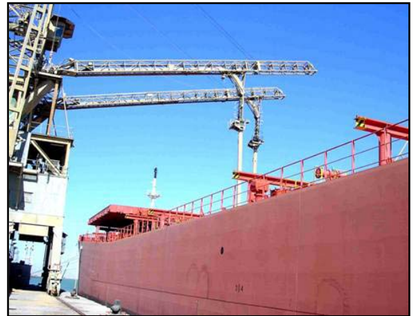
A ship unloads at Umm Qasr grain-receiving facility.

Telecommunications -- Objectives include: installing switches to restore service to 240,000 telephone lines in Baghdad area, and repairing the nation's fiber optic network from north of Mosul through Baghdad and Nasiriyah to Umm Qasr.