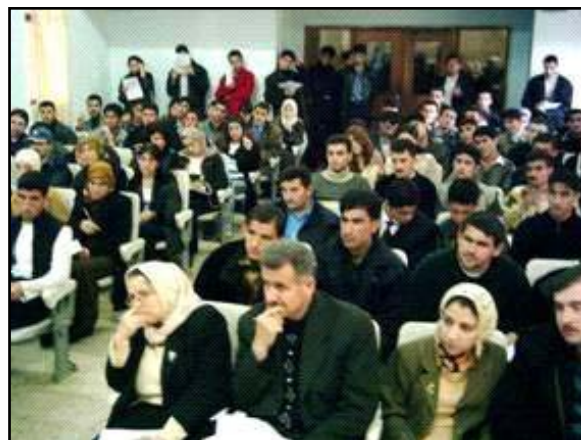
Participants at a Health Forum at the College of Arts in Arbil.