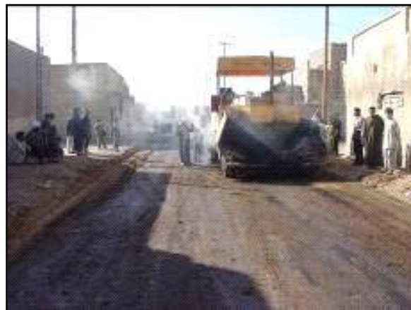
Heavy machinery paving roads in Al Rashadiyah.