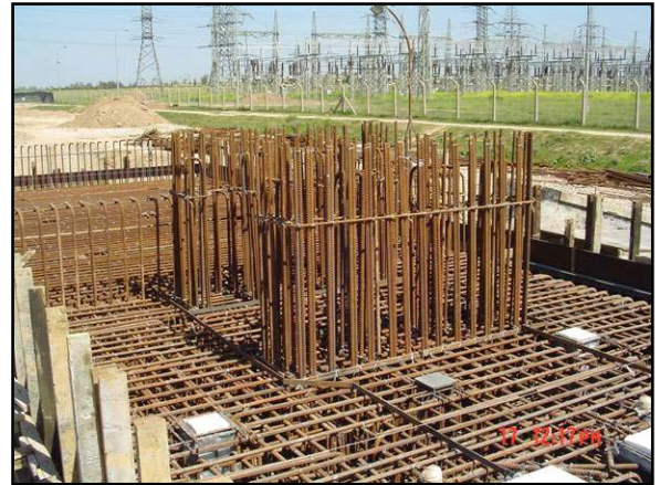
The foundation for the new V64 generator at Kirkuk substation.