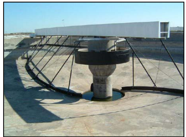
Ad Diwaniyah wastewater treatment plant.