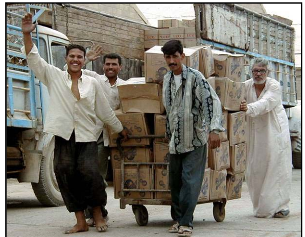
Food ration agents receiving goods through Iraq's Public Distribution System.