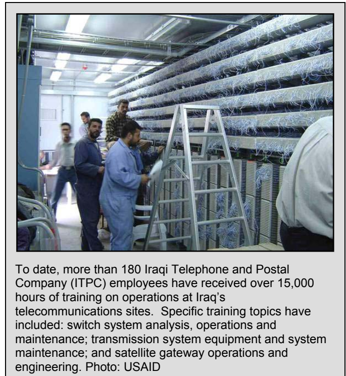
To date, more than 180 Iraqi Telephone and Postal Company (ITPC) employees have received over 15,000 hours of training on operations at Iraq’s telecommunications sites. Specific training topics have included: switch system analysis, operations and maintenance; transmission system equipment and system maintenance; and satellite gateway operations and engineering.