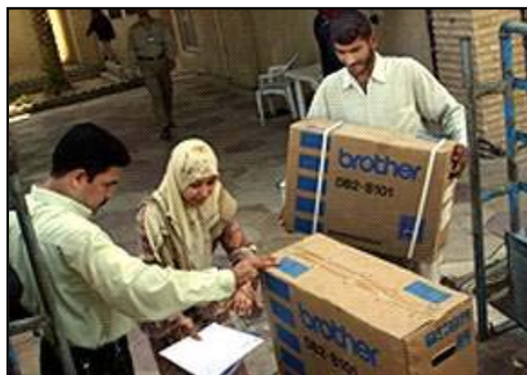
Sewing machines arriving at the Independent Women's Association.