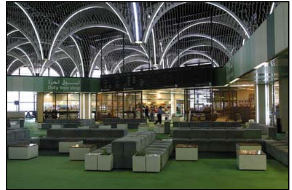
Baghdad International Airport has been refurbished and repaired with assistance from USAID and CPA.

Bridges and Railroads -- Objectives include: rehabilitating and repairing damaged transportation systems, especially the most economically critical networks.