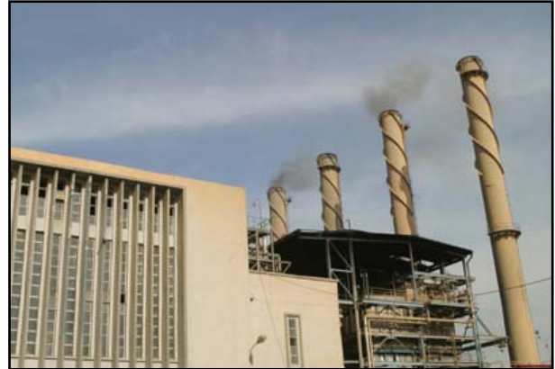
Baghdad's South power plant.