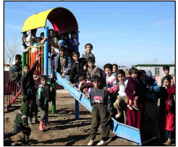
Hawraman's youth will have a new place to play

Community Action Program -- Objectives include promoting diverse, representative citizen participation in and among communities to identify, prioritize, and satisfy critical community needs, while utilizing local resources. CAP is implemented by five U.S. NGOs with offices in nine major Iraqi cities. Each concentrates on one region in Iraq: ACDI/VOCA (North), International Relief and Development--IRD (Baghdad), Cooperative Housing Foundation International--CHF (Southwest Central), Mercy Corps (Southeast Central), and Save the Children (South).