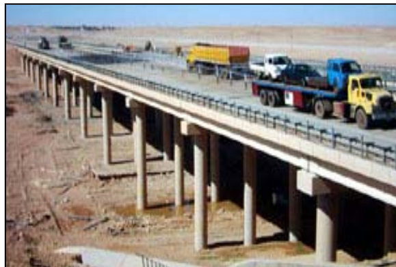
The south span of Al Mat Bridge