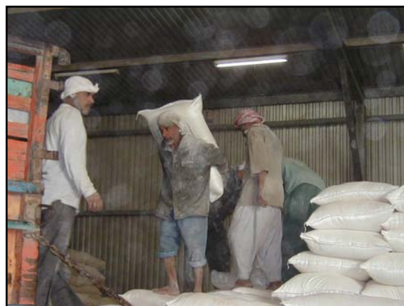
Agents in Iraq's public distribution system transport food to warehouses throughout Iraq.