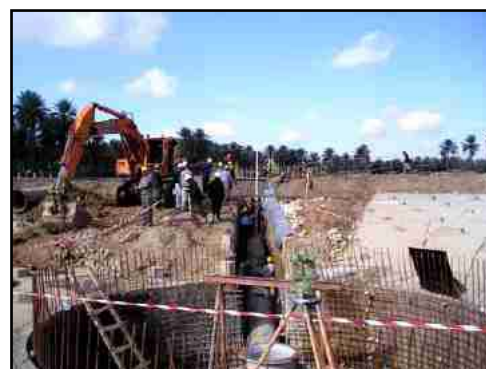
Workers survey the alignment of the clarifier influent pipe at Sharkh Dijlah water treatment plant.