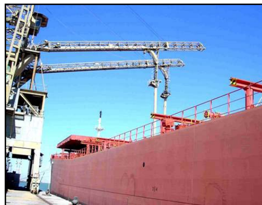
A ship unloads at Umm Qasr grain-receiving facility.