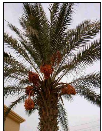
Dates at the semi-ripe (tamr) stage on a tree in Arbil.