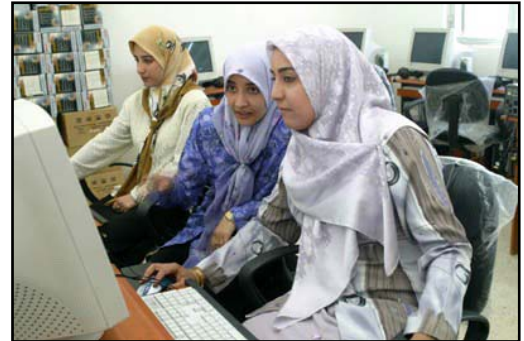
Iraqi women receive computer training at the Fatima Zahra Center for Women's Rights.

Transition Initiatives – Objectives include: building and sustaining Iraqi confidence in the transition to a participatory, stable, and democratic Iraq. Working closely with the CPA, USAID's Iraq Transition Initiative (ITI) assists Iraqi NGOs, national government institutions, and local governments to increase Iraqi support for the transition to sovereignty through quick-dispersing, high impact small grants.