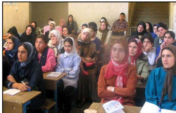
The ASUDA Organization will improve awareness of women’s rights to public security and basic services. ASUDA plays an important role in civil society as an independent advocate to the local government.