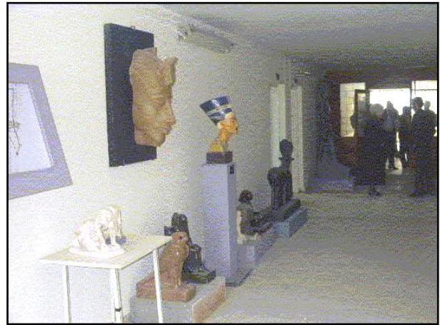
Baghdad University Department of Assyriology. Universities of Mosul and Baghdad and University of New York/Stony Brook are cooperating on cultural and environmental programs.

Economic Growth – Substantive areas include: currency conversion, development of economic statistics, rationalizing small business credit, drafting commercial legislation, supporting a national employment program, strengthening micro-finance programs, creating a bank-to-bank payment system, implementing a computerized financial management information system, developing a tax policy and administration, budget planning, insurance reform, telecommunications reform, and electricity reform.