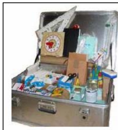
School-in-a-Box kits provided essential supplies to more than 800,000 students and 81,000 teachers.