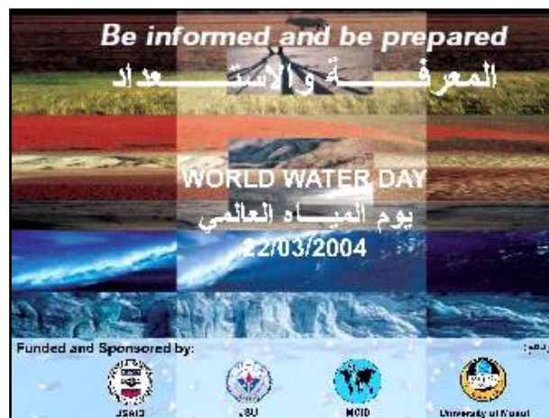
World Water Day on March 22 increased public understanding of the importance of water conservation.