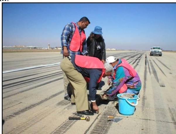
Iraqi civil engineers at Baghdad International Airport are assuming responsibility for runway maintenance.