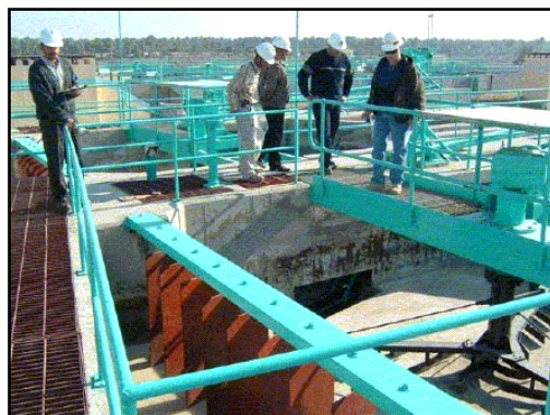
Inspections at Hillah wastewater treatment plant.